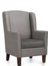
model GC36500 High back lounge chair