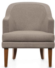
model GC36511 High back lounge chair