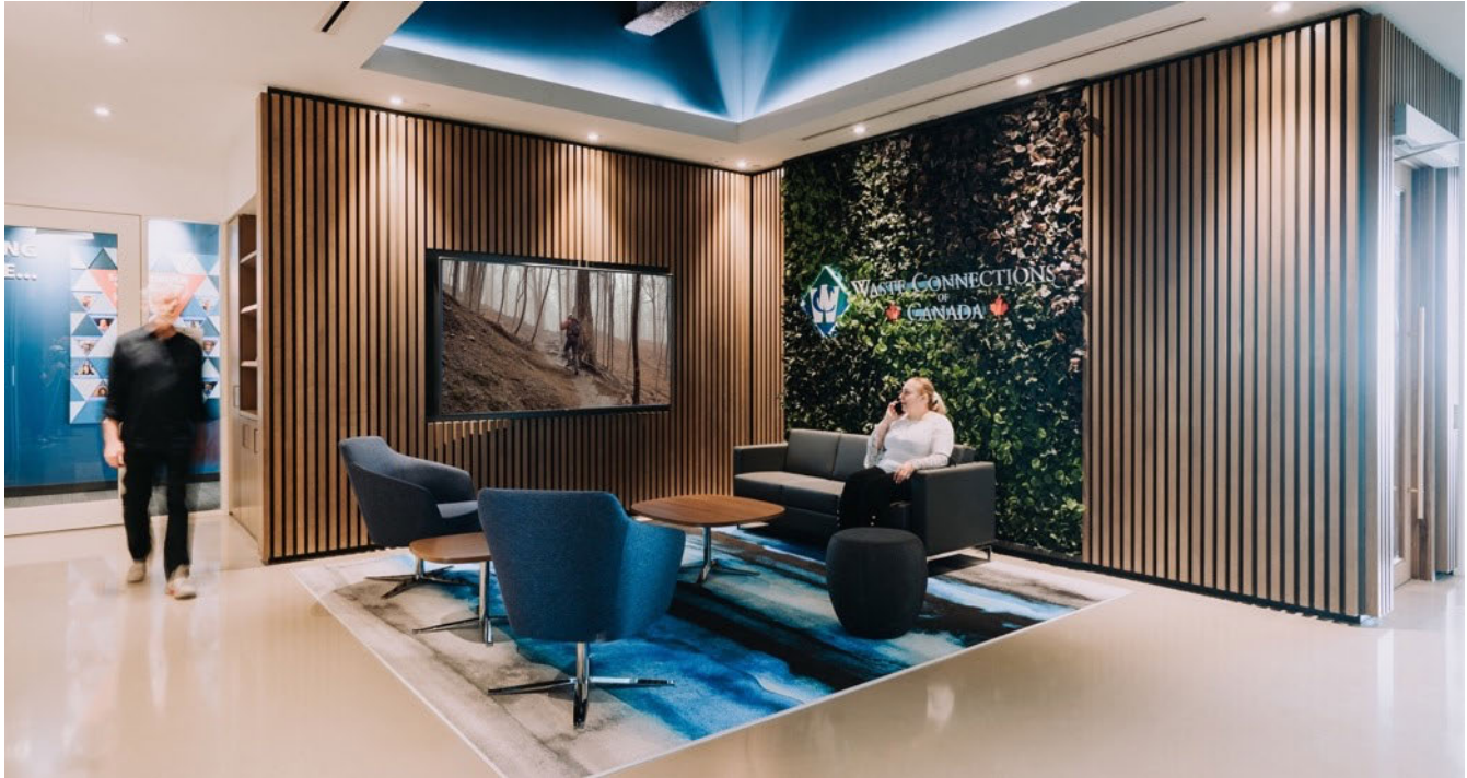
Design Firm: SDI Design

North America's foremost waste collection, transfer and recycling company creates an office that welcomes its employees and supports them in doing their best work.