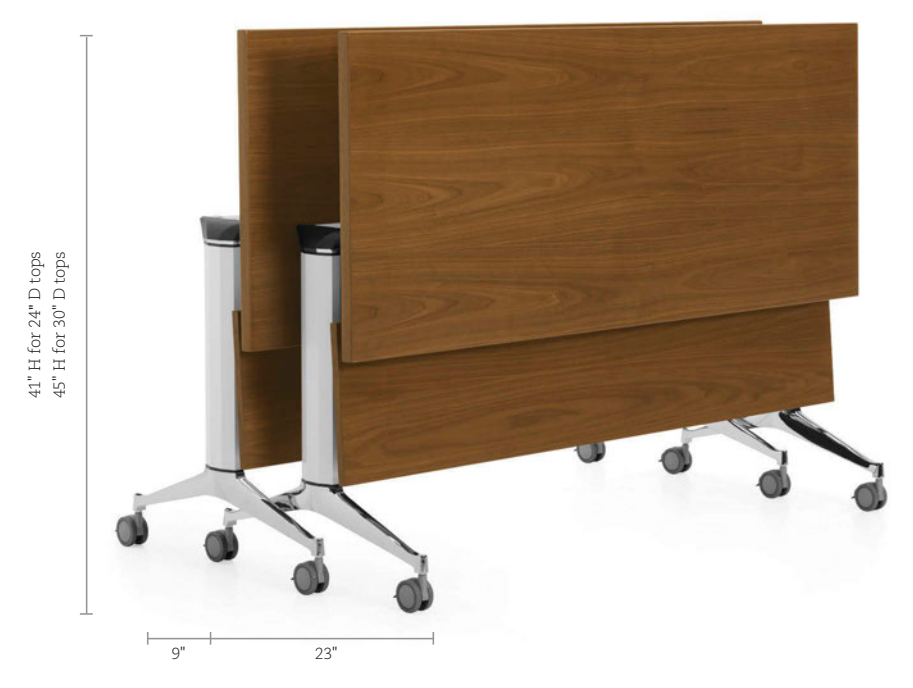
Optional modesty panel articulates with table top in upright position.