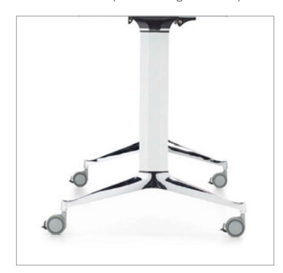
Leg column and cross beam available in a full range of finishes (Designer White shown). Foot is standard in Polished Aluminum