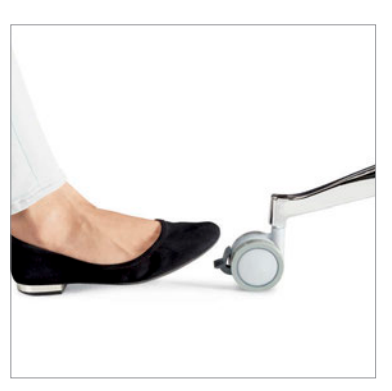
Locking dual wheel casters swivel 360^{\circ}