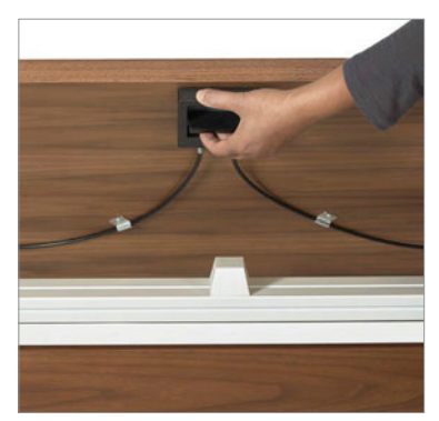
One handed flip up operation