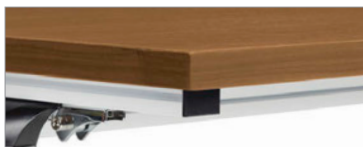
Table tops available in a large variety of veneer finishes (Latte Walnut shown)