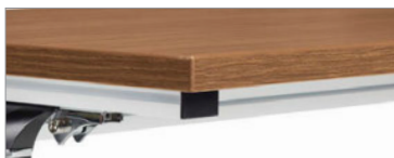
Table tops available in a large variety of laminate finishes (Walnut Heights shown)