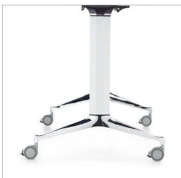
Leg column and cross beam available in a full range of finishes (Designer White shown). Foot is standard in Polished Aluminum