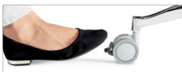
Locking dual wheel casters swivel 360°