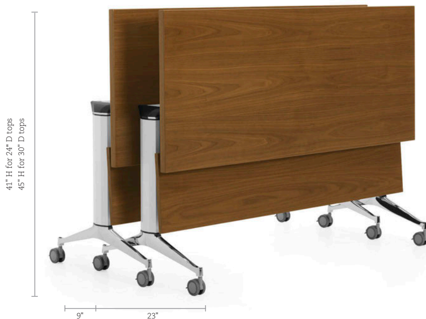
Optional modesty panel articulates with table top in upright position.