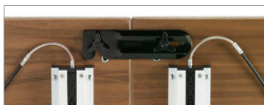
Optional ganging plates