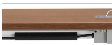
Optional wire management snap-in channel