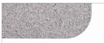
3" radius corners are available on solid surface (shown), high pressure laminate and thermally fused laminate tops