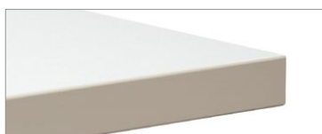
Thermally fused laminate top with contrasting flat edge - Latte shown