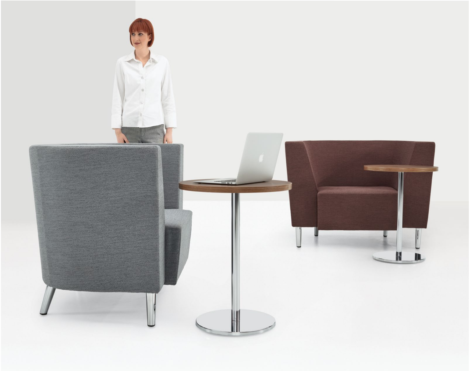
Table for one, please

Swap laptop tables provide enough surface space for a laptop, tablet or a coffee and croissant. Square base models are available with an offset column for extra legroom. The 25.6" height puts everything at the right height for lounge seating applications.