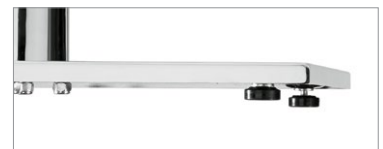
Leveling glides standard on all bases