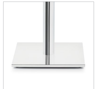
1/2" thick steel square and round metal bases