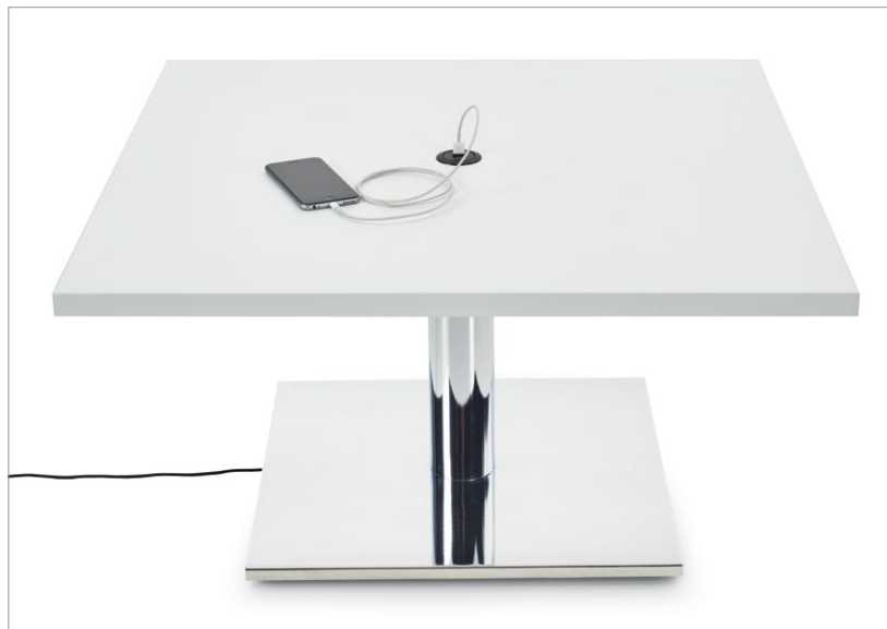
Power management in select columns