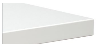
Thermally fused laminate top with matching flat edge