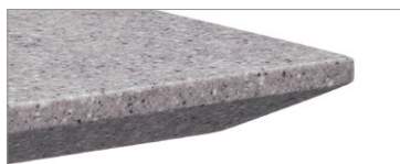
Solid surface top with knife edge