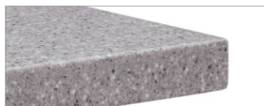
Solid surface top with flat edge