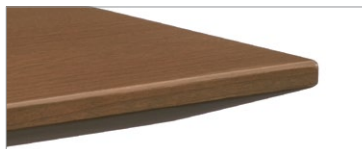
Veneer top with solid hardwood knife edge