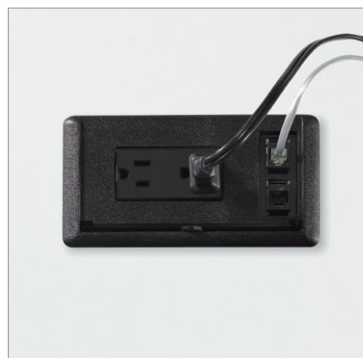
Optional power and data modules on select sizes