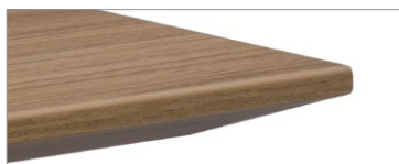
High pressure laminate top with matching knife edge