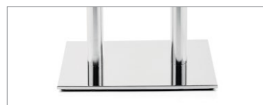
A dual column base is available for select tops