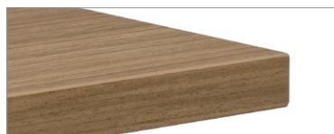
High pressure laminate top with matching flat edge