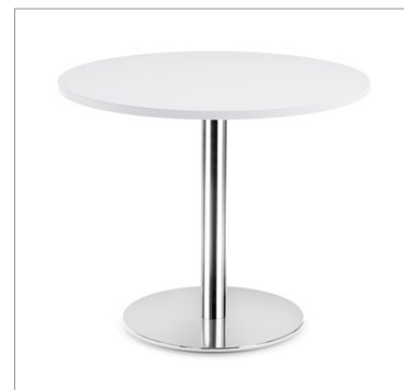
Four plated finishes available