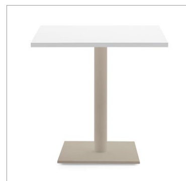
A wide selection of painted finishes available