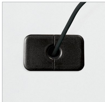
Optional wire management grommets on select sizes