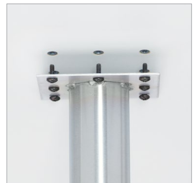
Factory installed metal inserts for easy metal-to-metal base connection