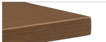
Veneer top with solid hardwood flat edge