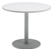
Fog shown with optional matching flat edge