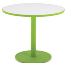
Cactus shown with optional matching flat edge