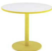
Dijon shown with optional matching flat edge