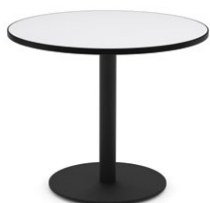
Black shown with optional matching flat edge