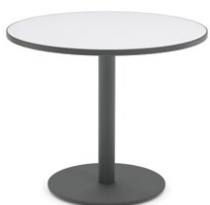
Shadow shown with optional matching flat edge