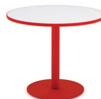
Scarlet shown with optional matching flat edge