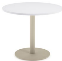
Nevada shown with optional matching flat edge