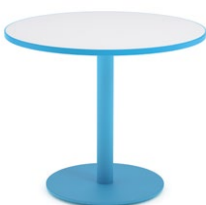
Buzz Blue shown with optional matching flat edge