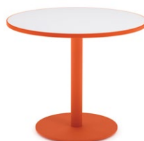
Carrot shown with optional matching flat edge