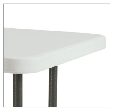
Round impact resistant edge