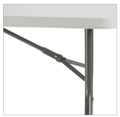
Folding auto-lock legs