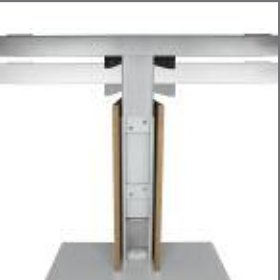
TABLE: HEIGHT ADJUSTABLE LEG