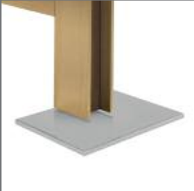
TABLE: BASE AND FOOT