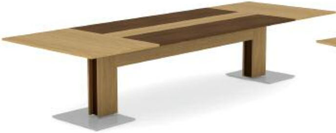
MODULAR WITH TECHNOLOGY TROUGH WITH CONTRASTING DOORS