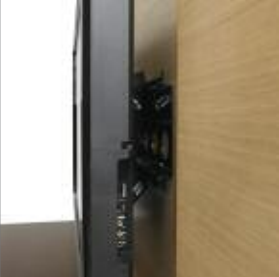
CREDENZA: MONITOR CONNECTION