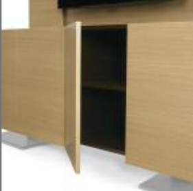
CREDENZA ADJUSTABLE SHELF