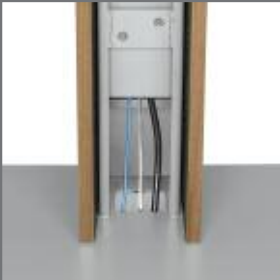
TABLE: WIRE MANAGEMENT