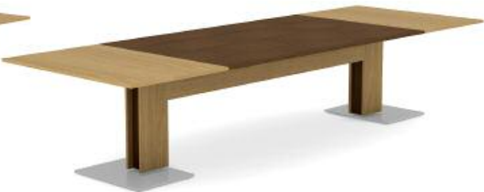
MODULAR WITH TECHNOLOGY TROUGH UNIFORM FINISHED DOORS