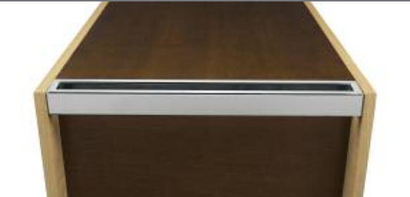
SERVING CART: HANDLE