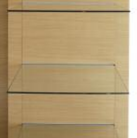
DISPLAY WALL GLASS SHELF