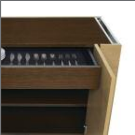
SERVING CART: CUTLERY DRAWER