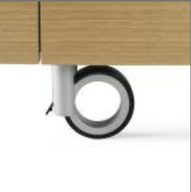
SERVING CART: CASTERS