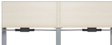
Optional daisy-chain power solution