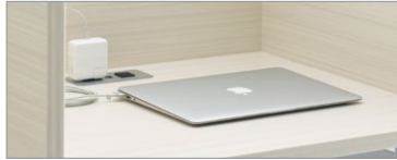
Optional power and data block