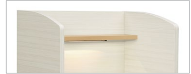
Optional LED task light