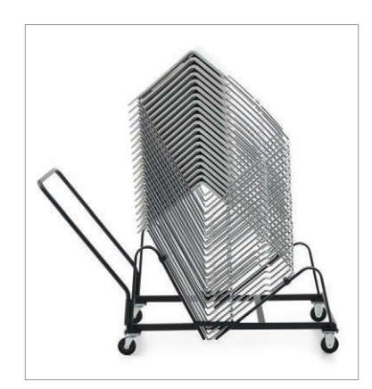
Stacks 20 high on dolly