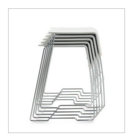
Stacks five high on floor