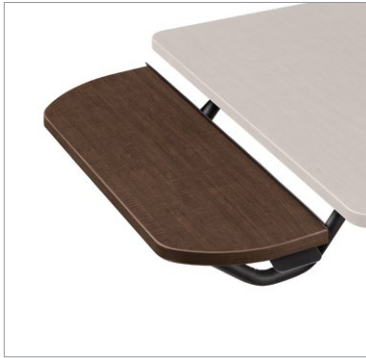
E-Z Lift dual arm tablet is height adjustable for the Enable table series