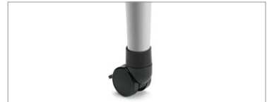
Tapered legs with locking casters

Please visit globalfurnituregroup.com for additional product information including industry and environmental certifications.