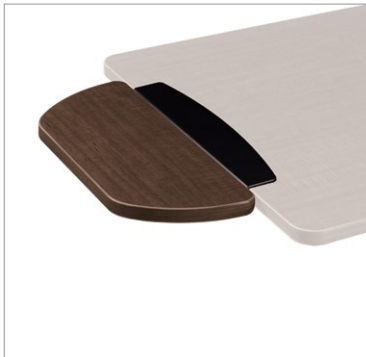
Fixed height tablet for dining tables allows extra leg room for wheelchair users