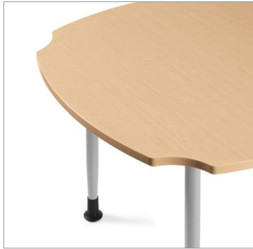
Floral table functionally designed curved corners