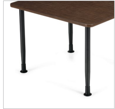
Metal legs for extra durability