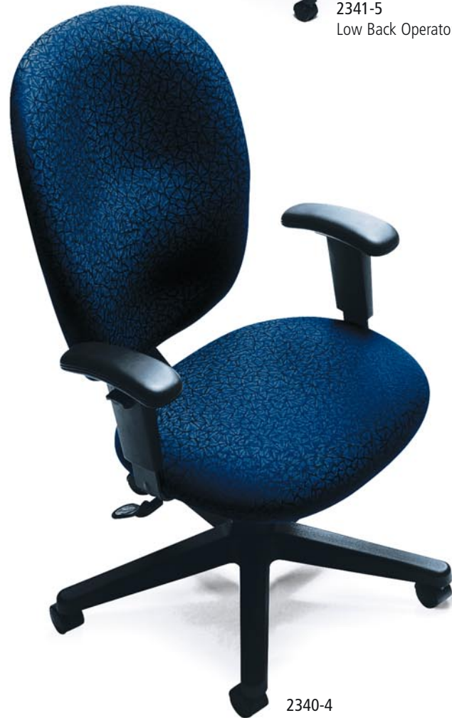
2340-4 High Back Function-Tilter

Yorkdale provides a good fit that matches, supports and moves with your body.