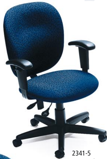
2341-5 Low Back Operator