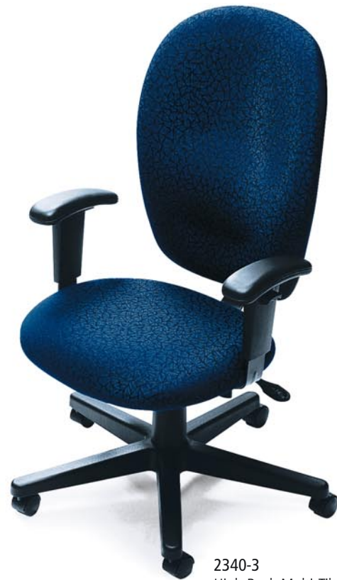
2340-3 High Back Multi-Tilter