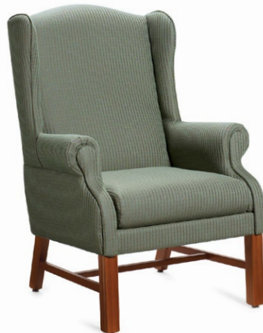
High back armchair

The Wingback™ chair offers timeless elegance in a refined, small-scale design – perfect for lounges, lobbies common areas and patient rooms. Developed in consultation with healthcare specialists, it was carefully engineered to meet the needs of healthcare and senior living environments. The back height, arm height, wing size and lumbar support have been modified to better fit the user physically, removing barriers common in larger models.