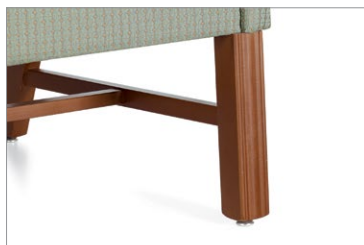
Chippendale leg available in all Global wood finishes

Please visit globalfurnituregroup.com for additional product information including industry and environmental certifications.