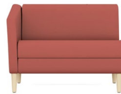
3431R Single seater, right arm