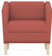
3431 Lounge chair