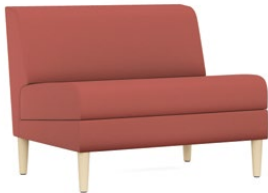
3431NA Single seater, armless