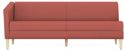
3433R Three seater, right arm