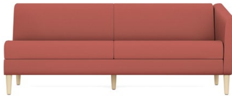
3433L Three seater, left arm