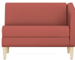
3431L Single seater, left arm