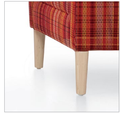
Solid wood legs are available in a wide range of finishes (Maple shown)