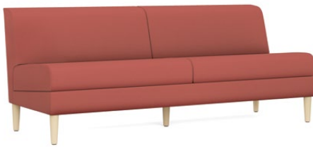
3433NA Three seater, armless