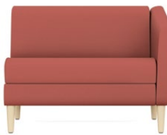
3431L Single seat, left arm