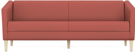
3433 Three seat sofa