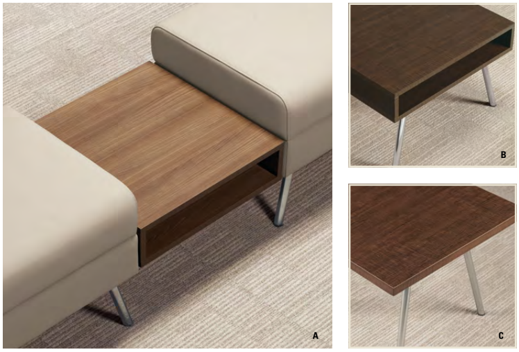
A. Bridging, shown in Winter Cherry B. Table Storage, shown in Tiger Walnut C. Table, shown in Tiger Walnut