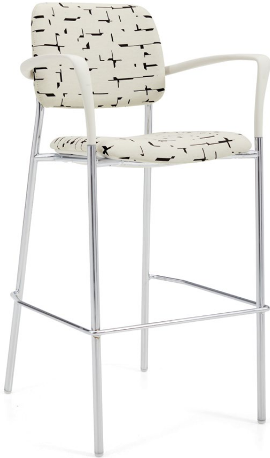
Bar height stool, upholstered seat and back