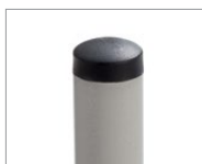
Colored nylon (Black or Sand)