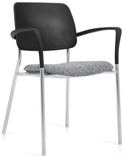
Armchair, upholstered seat and polypropylene back