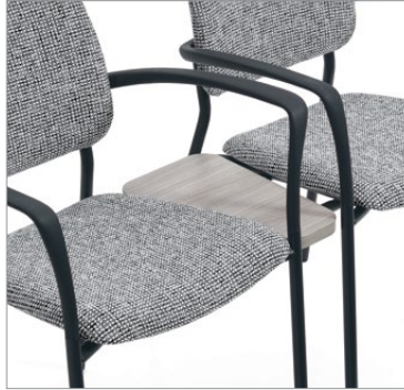
9" in-line linking table