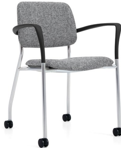
Armchair, upholstered seat and back on casters

Top: Seating shown with Black frame, and Night polypropylene seat and back; Black frame with upholstered seat and back in LUUM, Macrotweed, White Ash. Bottom: Seating shown with Brushed Chrome frame, LUUM, Macrotweed, White Ash seat and Night polypropylene back; Brushed Chrome frame on casters with upholstered seat and back in LUUM, Macrotweed, White Ash.