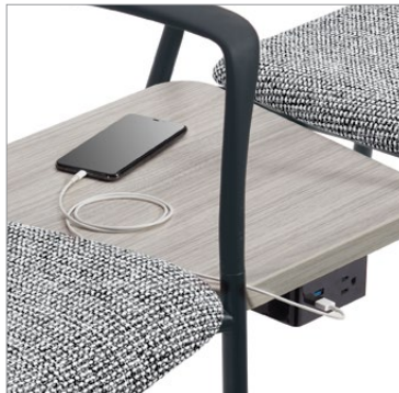
Optional power and USB charging, undermount attachment