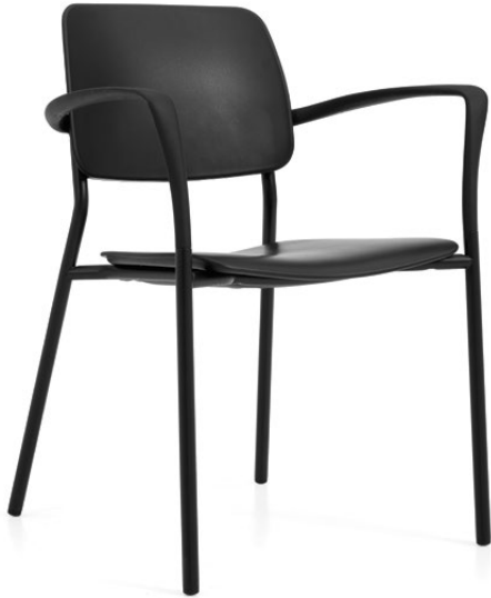
Armchair, polypropylene seat and back