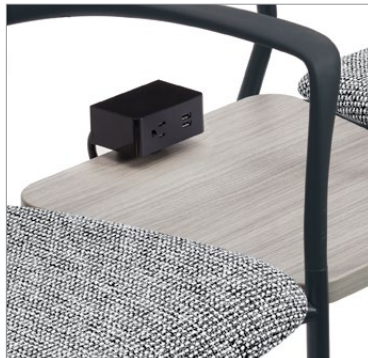
Optional power and USB charging, clamp attachment