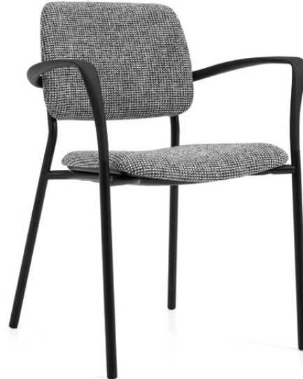
Armchair, upholstered seat and back