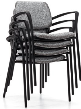
Upholstered chairs stack 4 high on the floor Unupholstered chairs stack 6 high on the floor