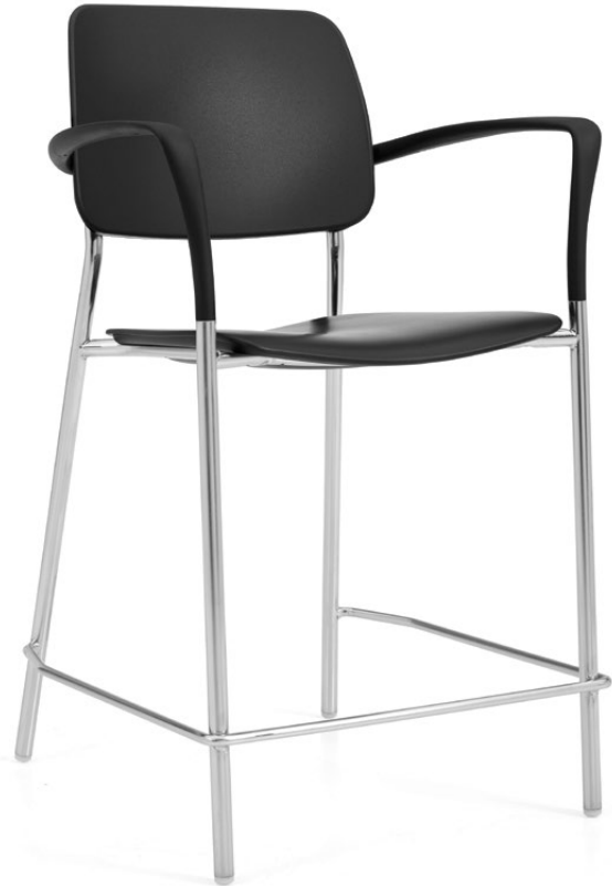
Counter height stool, polypropylene seat and back

Willow's extensive range of models, finishes and upholstery options provide countless creative possibilities. Its versatile and stackable design makes Willow the "everywhere chair" for the workplace, education and beyond.