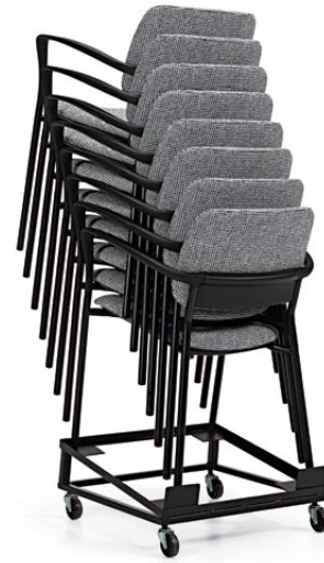
Upholstered chairs stack 8 high on the dolly Unupholstered chairs stack 10 high on the dolly