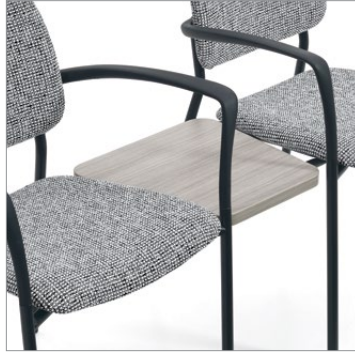
16" in-line linking table

Connecting tables, brackets and power options