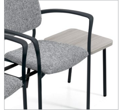
End linking table