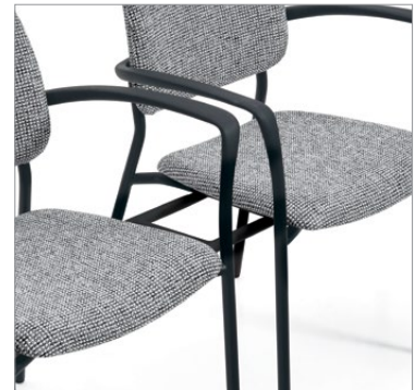
In-line ganging brackets