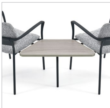
120° corner linking table

Willow combines comfort and durability with the flexibility of a modular seating series. Individual seats can be joined together with corner, end and in-line linking tables to suit the allocated space and application.