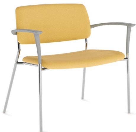
Bariatric armchair, upholstered seat and back