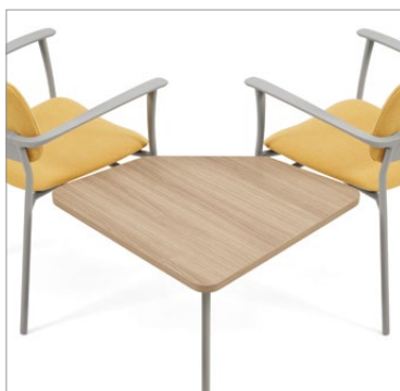
90° corner linking table