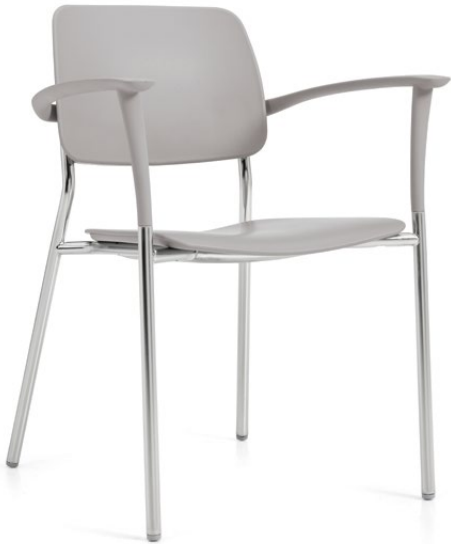
Armchair, polypropylene seat and back