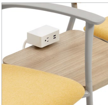
Optional power and USB charging, clamp attachment