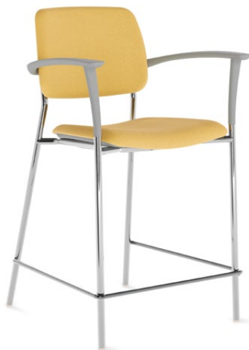
Counter stool with arms, upholstered seat and back