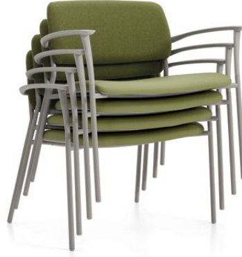
Bariatric armchairs stack 4 high on the floor, 8 high on the dolly