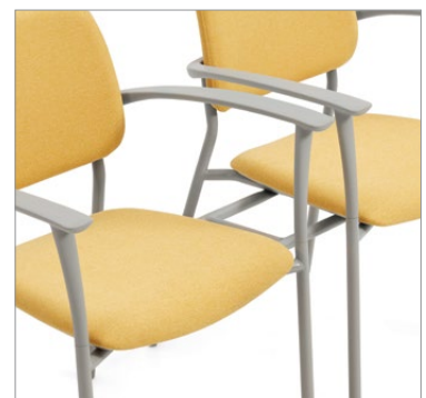
In-line ganging brackets