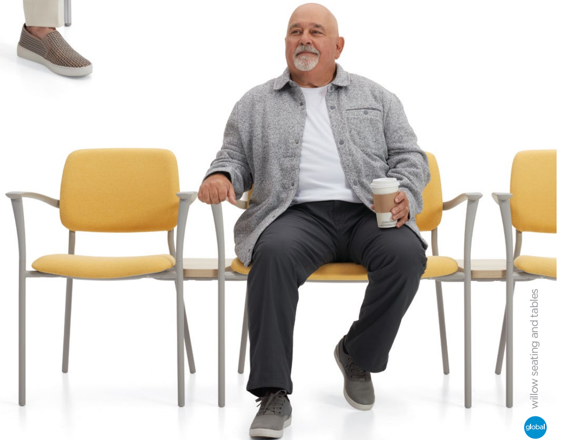
Top left: Seating shown with Brushed Chrome frame and Sand frame, Sand arms, and upholstered seats and backs in LDI Debut Tuft, Glow. Top right and above: eating shown with Sand frame, and upholstered seats and backs in LDI Debut Tuft, Glow. Tables shown with Noce Leggero tops.

This inclusive seating series is designed to accommodate a diverse community of people. The bariatric model is rated and warranted for up to 600 lbs. and also serves as a parent and child chair in pediatric settings.