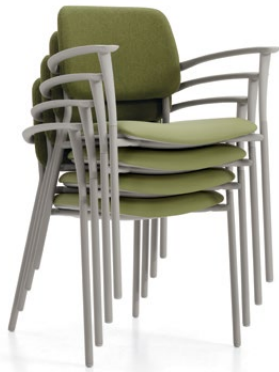
Upholstered chairs stack 4 high on the floor Unupholstered chairs stack 6 high on the floor