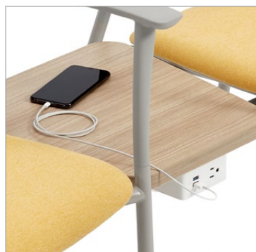
Optional power and USB charging, undermount attachment