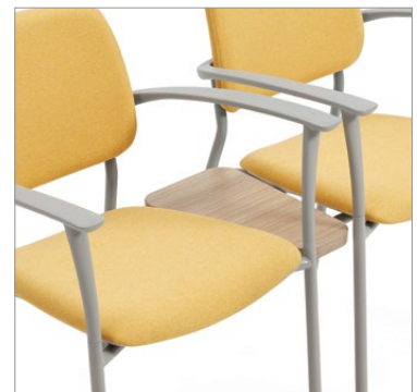
9" in-line linking table

Willow combines comfort and durability with the flexibility of a modular seating series. Individual seats can be joined together with corner, end and in-line linking tables to suit the allocated space and application.