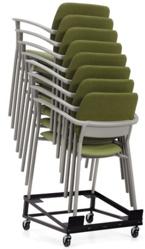
Upholstered chairs stack 8 high on the dolly Unupholstered chairs stack 10 high on the dolly