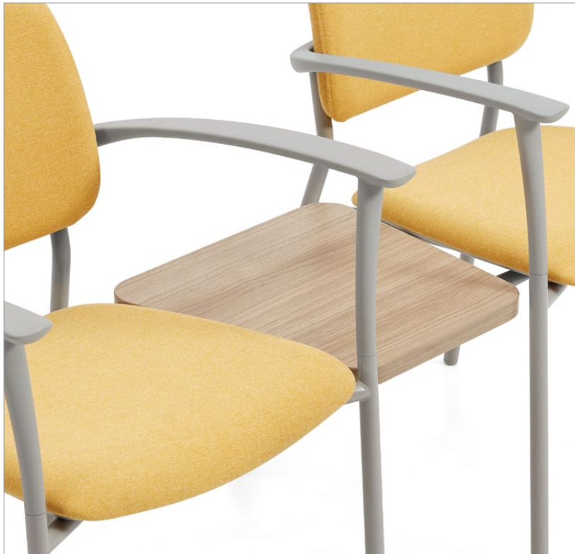
16" in-line linking table

Connecting tables, brackets and power options