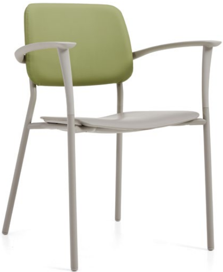
Armchair, polypropylene seat and upholstered back