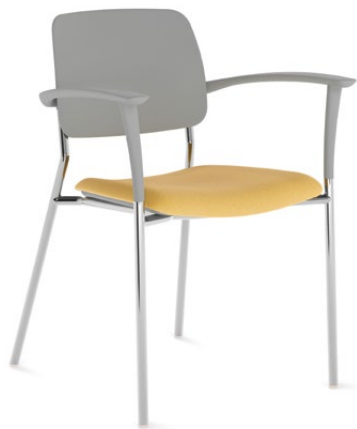
Armchair, upholstered seat and polypropylene back