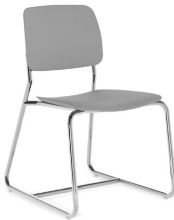
Armless chair, sled base, polypropylene seat and back