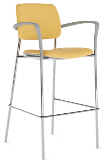
Bar stool with arms, upholstered seat and back

With the exception of the hip chair, all models are available with or without arms. The bariatric chair is available with a sled base and as a hip chair. Backed by Global's Limited Lifetime Warranty, Willow is GREENGUARD Gold and BIFMA LEVEL 3 certified.