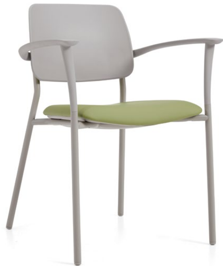
Armchair, upholstered seat and polypropylene back