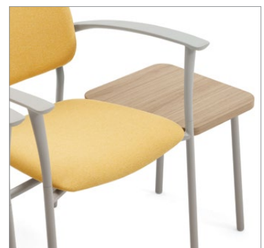
End linking table