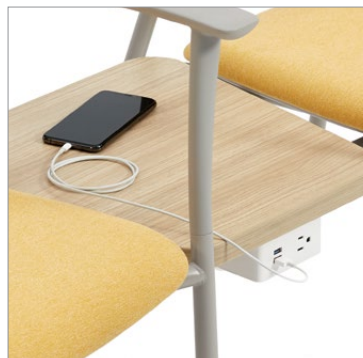
Optional power and USB charging, undermount attachment