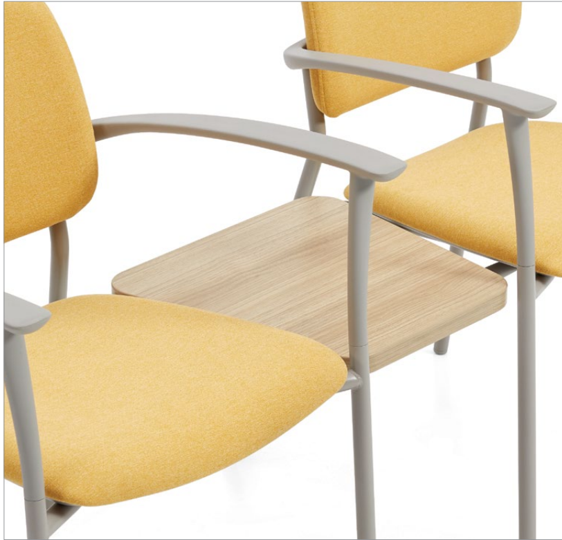
16" in-line linking table

Connecting tables, brackets and power options