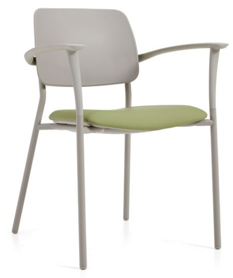
Armchair, upholstered seat and polypropylene back