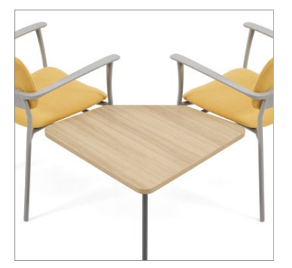
90° corner linking table