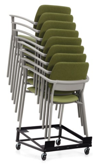
Upholstered chairs stack 8 high on the dolly Unupholstered chairs stack 10 high on the dolly