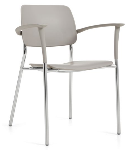
Armchair, polypropylene seat and back