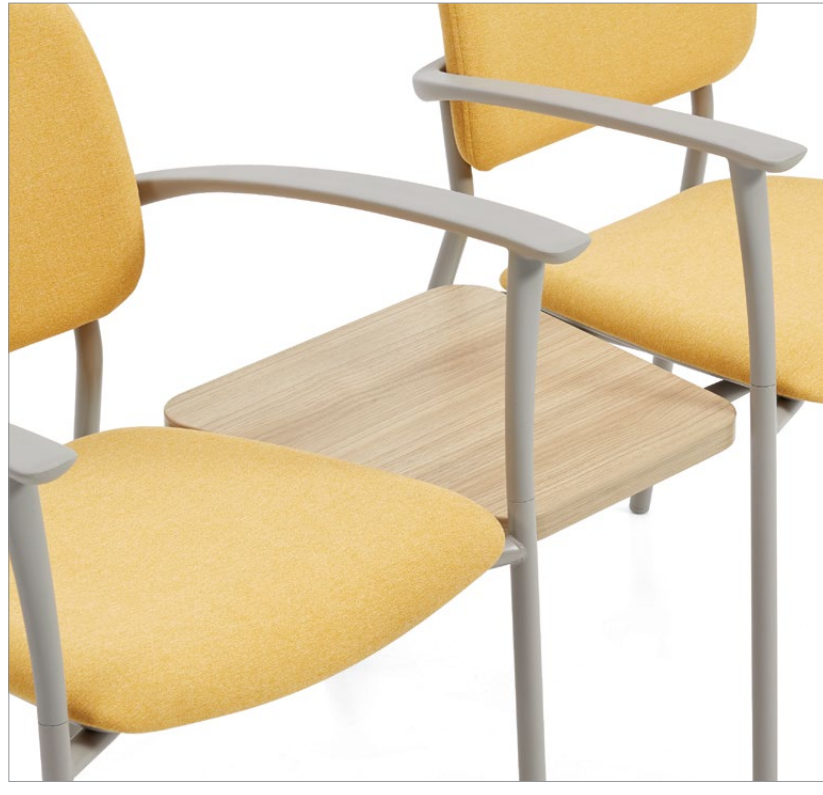
16" in-line linking table

Connecting tables, brackets and power options