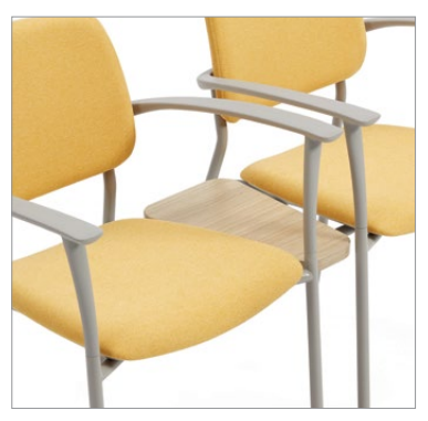
9" in-line linking table

Willow combines comfort and durability with the flexibility of a modular seating series. Individual seats can be joined together with corner, end and in-line linking tables to suit the allocated space and application.