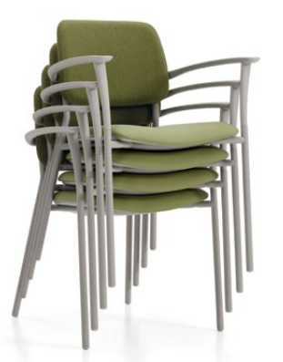
Upholstered chairs stack 4 high on the floor Unupholstered chairs stack 6 high on the floor