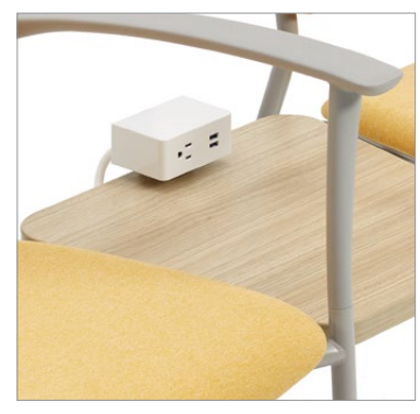
Optional power and USB charging, clamp attachment