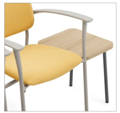
End linking table