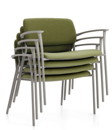
Bariatric armchairs stack 4 high on the floor, 8 high on the dolly