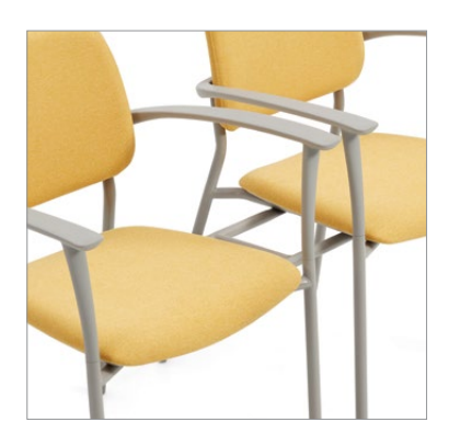
In-line ganging brackets