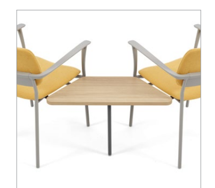
120° corner linking table