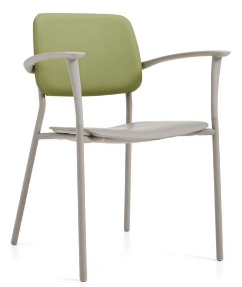
Armchair, polypropylene seat and upholstered back