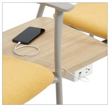
Optional power and USB charging, undermount attachment

Willow combines comfort and durability with the flexibility of a modular seating series. Individual seats can be joined together with corner, end and in-line linking tables to suit the allocated space and application.