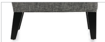
9" tapered solid wood leg