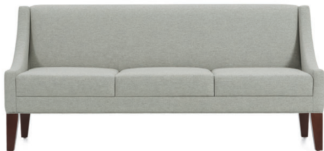
Three seat sofa