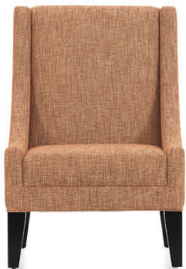
High back lounge chair