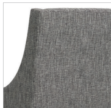
One piece upholstery on back

Please visit globalfurnituregroup.com for additional product information including industry and environmental certifications.