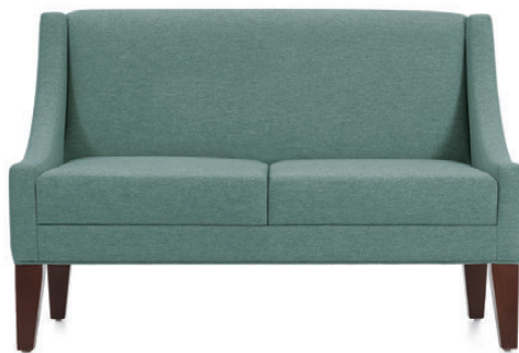
Two seat sofa