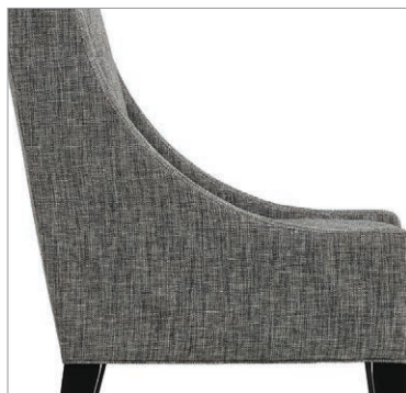
Classic swoop arm design