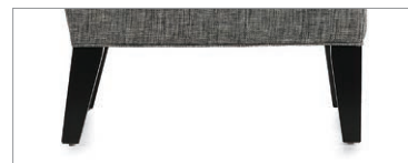
9" tapered solid wood leg