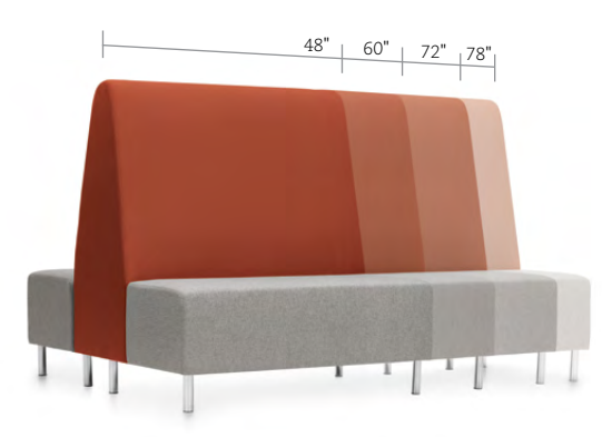
Double-sided banquette with shared back in four seat widths

Single-sided banquette with or without fully upholstered back panel in four seat widths