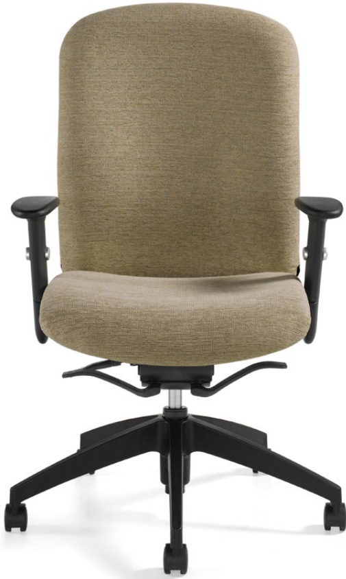
High back weight sensing synchro-tilter