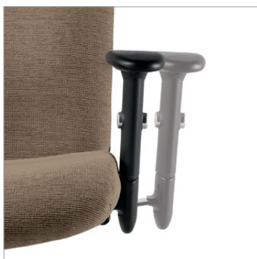
Width adjustable arms