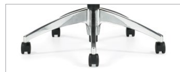
Optional polished aluminum

Please visit globalfurnituregroup.com for additional product information including industry and environmental certifications.