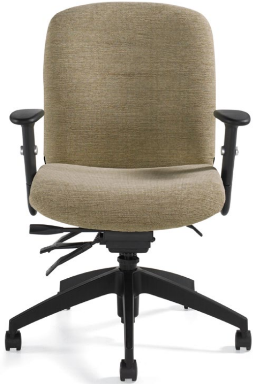
Medium back multi-tilter

Truform® offers a range of models in with four mechanism options: tilters, weight sensing synchro-tilters, multi-tilters, and multi-tilters for heavy duty applications weighing up to 350 lbs. Its gently curved seat and back cushions provide a comfortable seating experience.