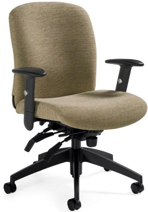
Medium back heavy duty multi-tilter