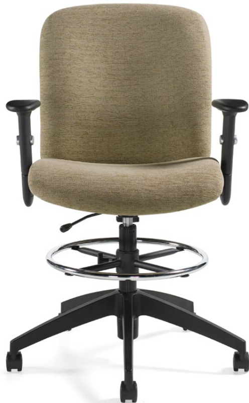
Medium back height adjustable stool

Seating shown in Maharam Fluent Crypton, Lynx.