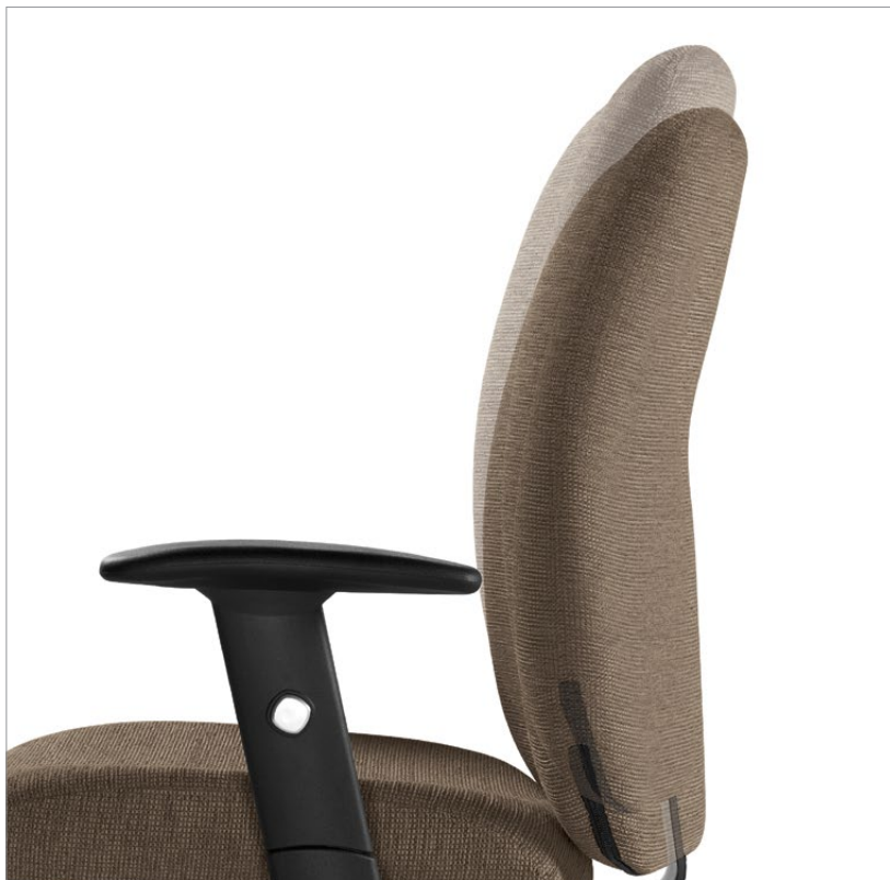
Ratchet back and lumbar height adjustment