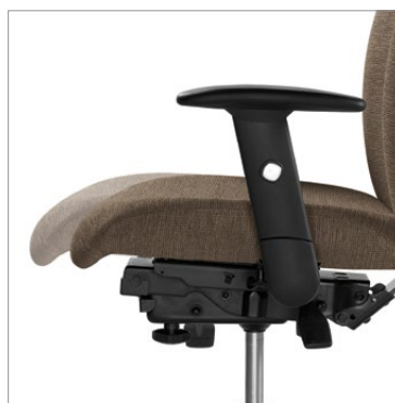
Sliding seat depth adjustment