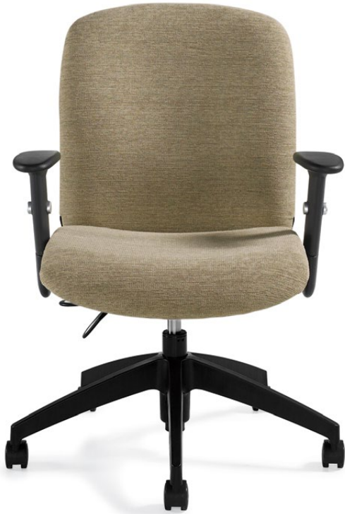
Medium back operator