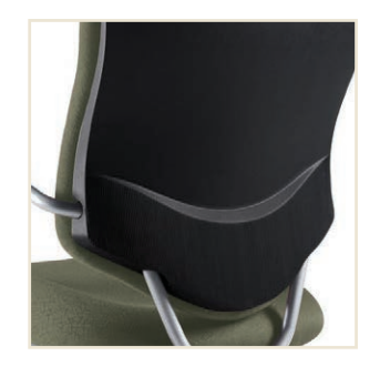
Protective outer back. Beautifully sculpted outer back shell is made from impact resistant polypropylene for additional durability.