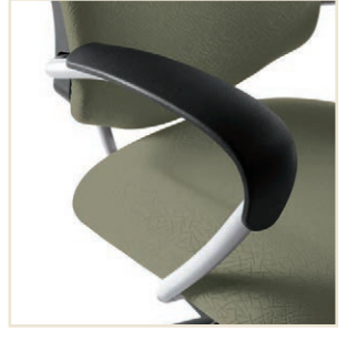
Soft durable arm. The broad sculptured armcap is soft to the touch and made from durable self-skinned urethane.