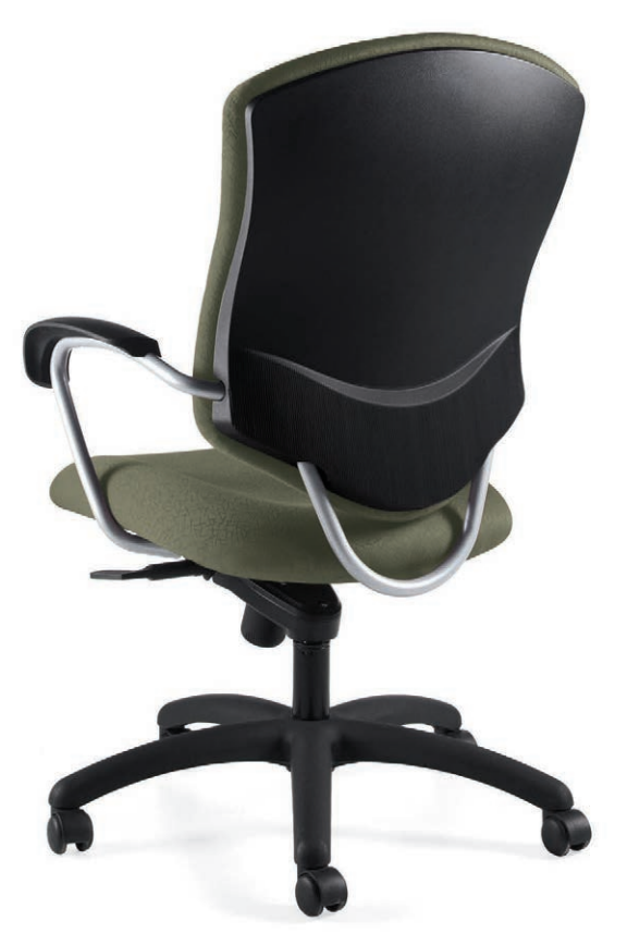
High back knee-tilter