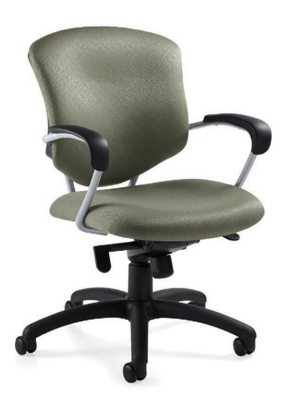
Medium back knee-tilter

Contoured cushions support the user in comfortable, contemporary style. Supra ^{\text{\tiny{M}}} is available with a standard Black fiberglass reinforced nylon base or an optional Tungsten finished steel base. An armchair is available with casters for easy mobility. Value, beauty and comfort — all in one chair series. Designed by Zooey Chu.