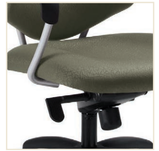
Knee-tilter. Chair tilts from a pivot point at the front of the seat. This keeps your feet on the floor as you rock and reduces pressure behind the knees; thereby enhancing blood flow. Tilt tension is adjustable for body weight.