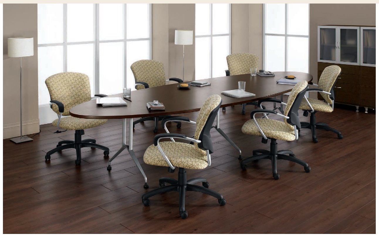
Supra is defined by superior practicality in many office applications. The popular choice for management, meeting rooms and guest seating.