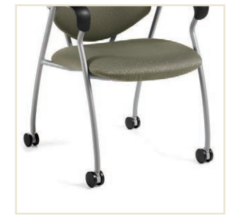
Standard Tungsten frame on armcharis