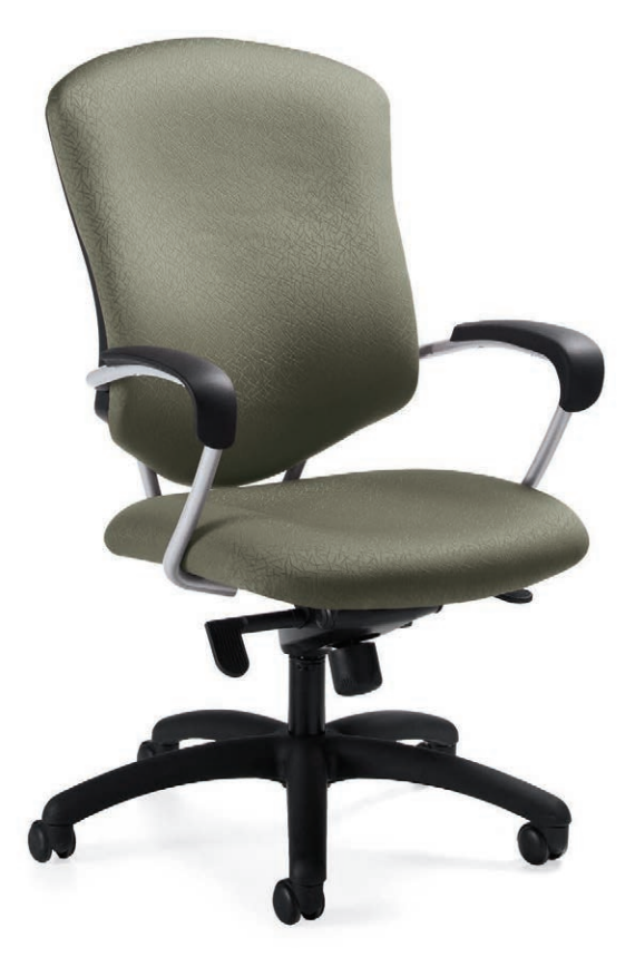
High back knee-tilter

Value, beauty & comfort — all in one exceptional chair series.