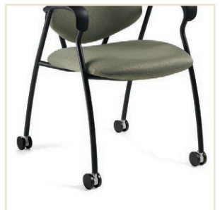
Four-legged armchair on casters for easy mobility, optional Black frame at no upcharge