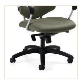
Black fiberglass reinforced nylon base is standard (optional Tungsten and Polished Aluminum)