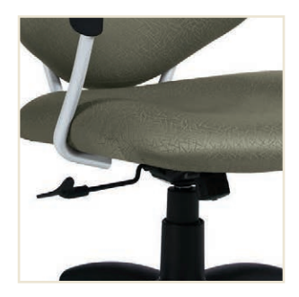
Tilter. Chair offers tilt tension adjustment and tilts from a pivot point under the center of the seat allowing you to rock comfortably. Chair can be locked in an upright keyboarding position.