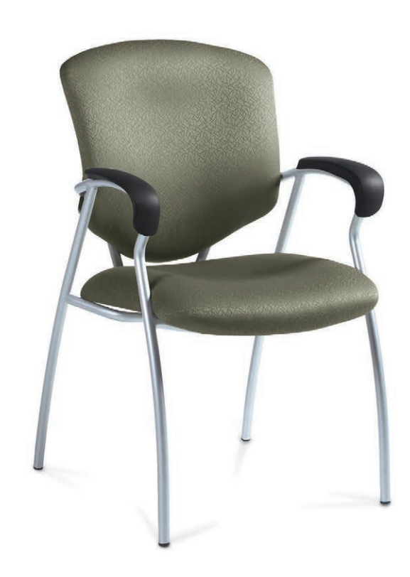
Four-legged armchair with standard Tungsten frame