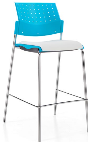
Armless bar stool, upholstered seat and polypropylene back