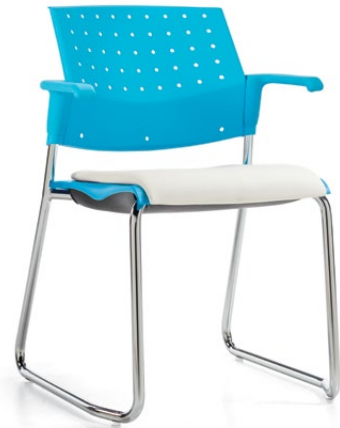
Armchair, sled base, upholstered seat and polypropylene back