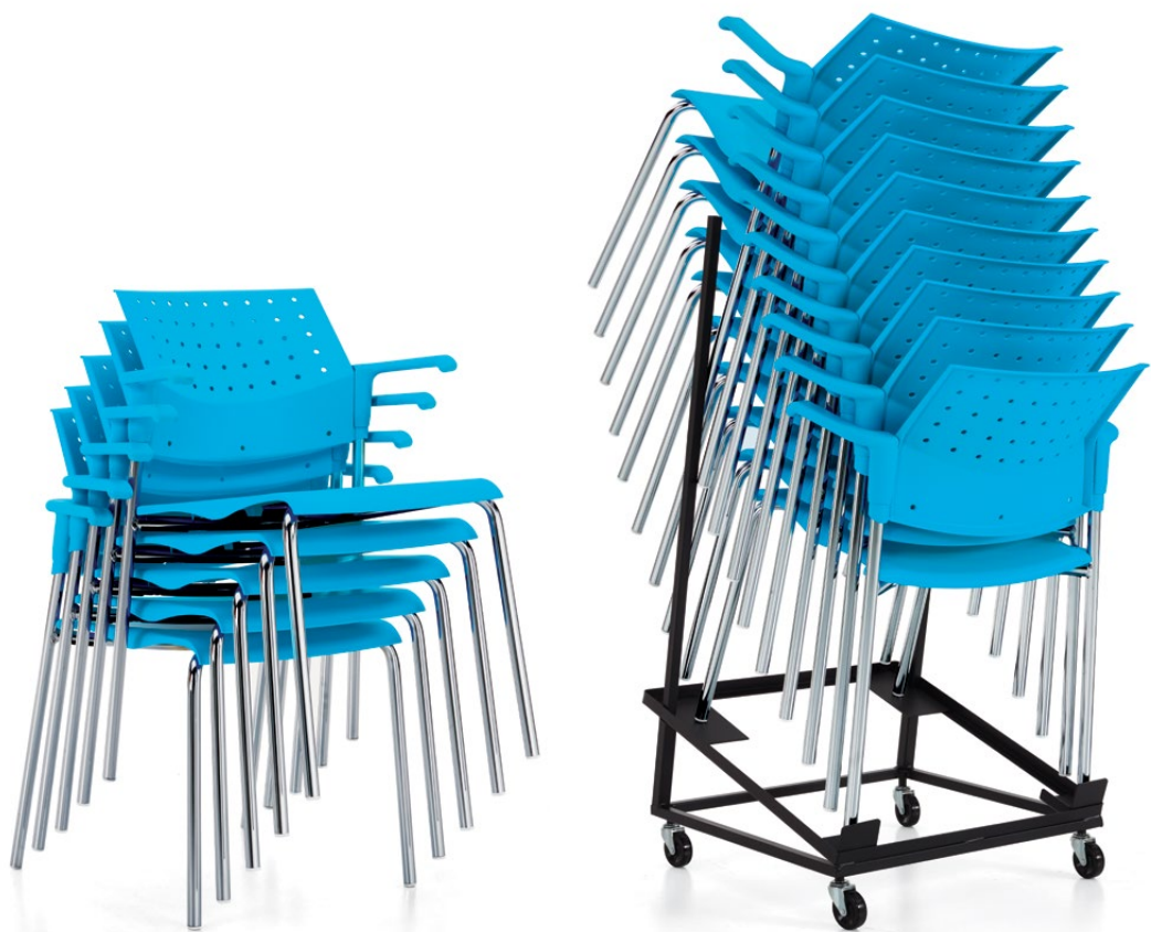
Chairs can stack 5 high on floor or 10 high on the dolly