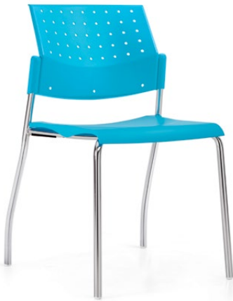
Armless chair, polypropylene seat and back