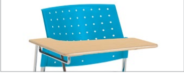
Tablet is available in Black polymer or wood laminate (shown)