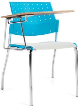
Armless chair with right tablet, upholstered seat and polypropylene back