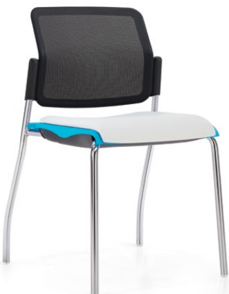
Armless chair, upholstered seat and mesh back