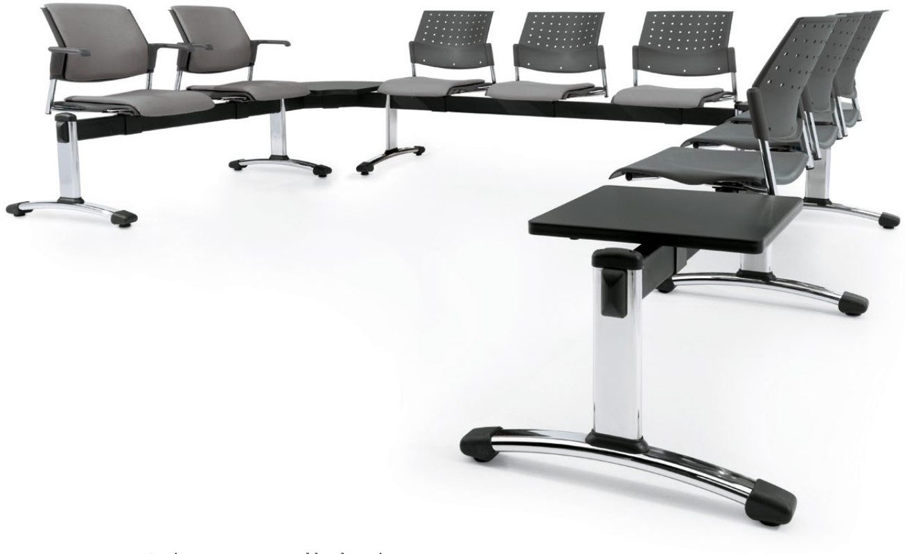
Sonic Beam - seat and back options