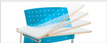
Tablet lifts to 90° for easy access