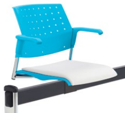
Upholstered seat with polypropylene back