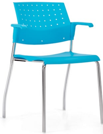
Armchair, polypropylene seat and back