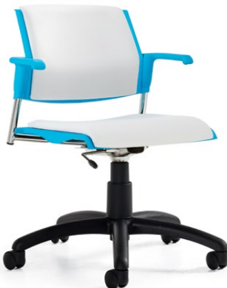
Task chair with arms, upholstered seat and back