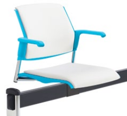
Upholstered seat and back

Sonic Beam is an affordable and efficient seating solution to furnish public spaces or reception areas. Available in multiple lengths to accommodate any seating configuration. Seat and table modules can be placed in any order along the beam. Upholstered seat and back inserts are replaceable for easy maintenance.