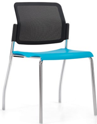
Armless chair, polypropylene seat and mesh back