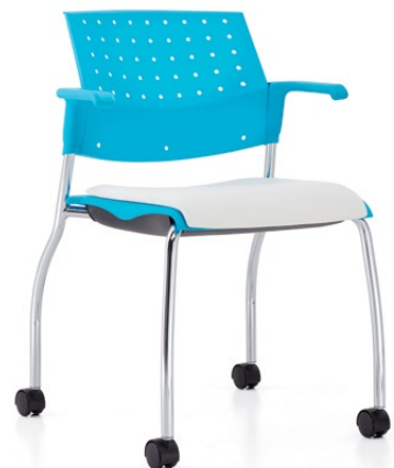
Armchair, on casters, upholstered seat and polypropylene back