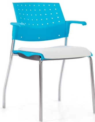
Armchair, upholstered seat and polypropylene back