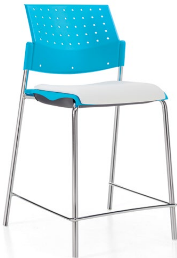
Armless counter stool, upholstered seat and polypropylene back