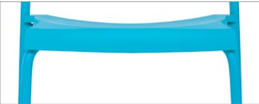
Color coordinated eco-friendly paint finishes