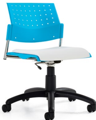
Armless task chair, upholstered seat and polypropylene back