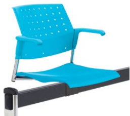
Polypropylene seat and back