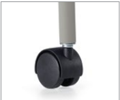
Casters are available