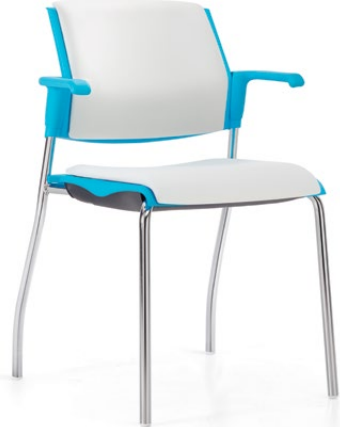
Armchair, upholstered seat and back

Sonic offers a wide range of models including guest chairs with or without arms, on four legs, sled bases or casters. Counter and bar height stools, task chairs, left or right tablet arm options and a beam seating solution round out the series. Backs are available in polypropylene, mesh or upholstered options. Seats can be specified in either polypropylene or with an upholstered seat cushion for added comfort.