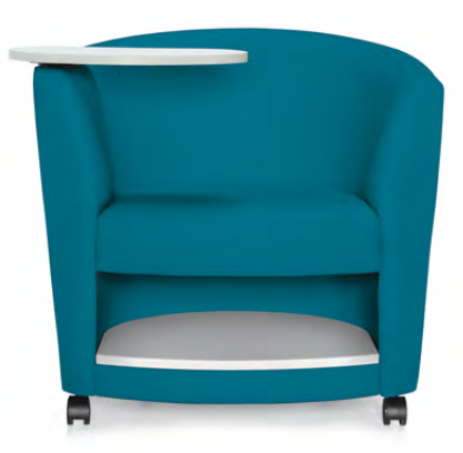
Right tablet with laminate bookshelf