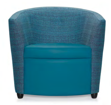
Fabric body, leather seat