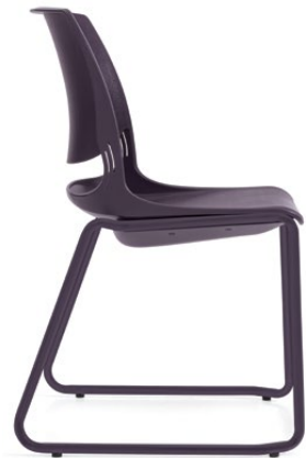
Armless chair with sled base