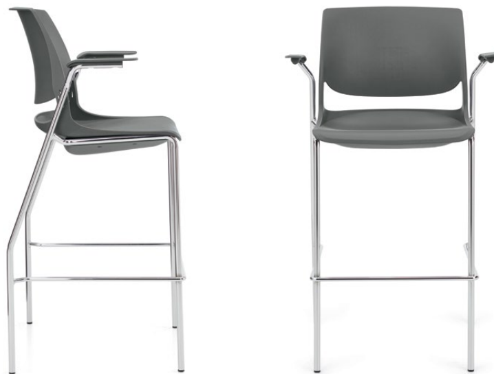
Bar stool with arms

Stools stack five high on the floor and chairs stack up to five high on the floor or 10 high on the dolly. The color-matching under seat shroud protects the seat surface and upholstery when stacked. Specify Rebound where frequent reconfiguration is required. Stack it and store it at a moment's notice.