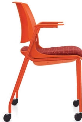
Armchair on casters, upholstered seat