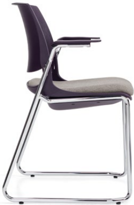
Armchair with sled base, upholstered seat