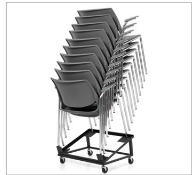
Chairs stack 10 high on dolly (glides or casters)