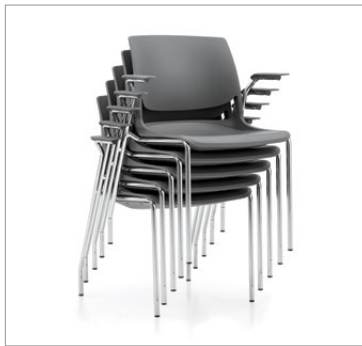
Chairs stack 5 high on the floor (glides or casters)