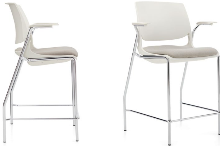
Counter stool with arms, upholstered seat