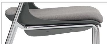
Upholstered seat option and color-matching under seat shroud