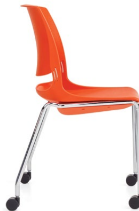
Armless chair on casters