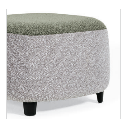
Specify with one or two textiles