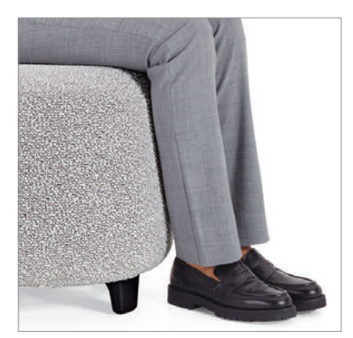
Standard seat height at 17.5" with 3" legs (shown) or casters