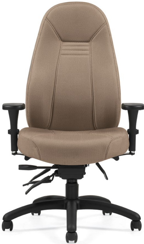
High back multi-tilter