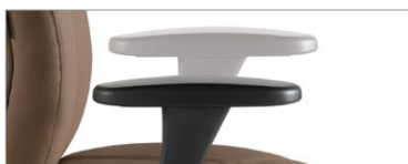
Arms are height adjustable for effective arm support