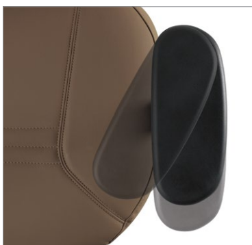
Armcap slides forward or backward to desired position (rotates 30° to provide more effective support for keyboarding)