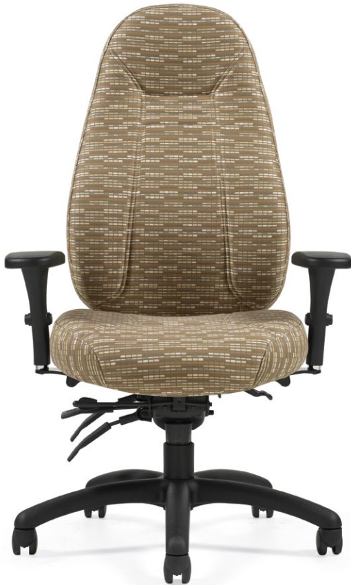
High back heavy duty 24 HR multi-tilter