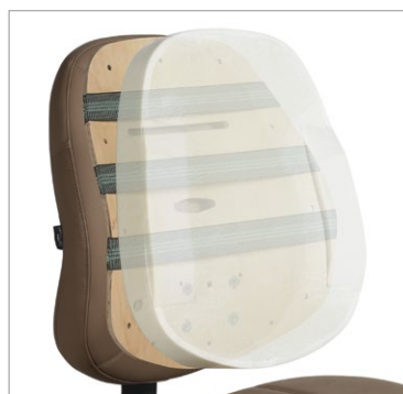
Elastomeric back support system provides support with no pressure along the spine

Please visit globalfurnituregroup.com for additional product information including industry and environmental certifications.