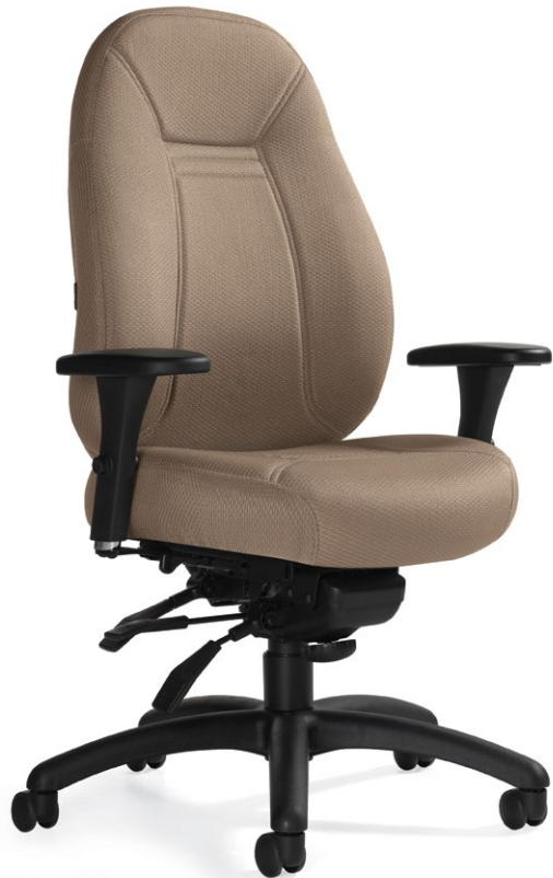
Medium back knee-tilter

ObusForme Comfort is recommended by chiropractors worldwide. Its unique support system helps reduce back strain by guiding your back into a correct healthy posture. The backrest supports the natural lazy “S” curve of your spine.