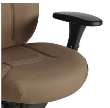
Contoured seat shape effectively supports the pelvis and hips in a comfortably balanced position