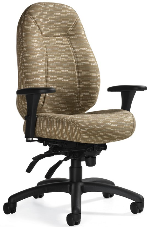
Medium back heavy duty 24 HR multi-tilter

24 HR models are designed for multi-shift use and will accommodate users up to 350 lbs. ObusForme Comfort is renowned for providing exceptional back comfort.