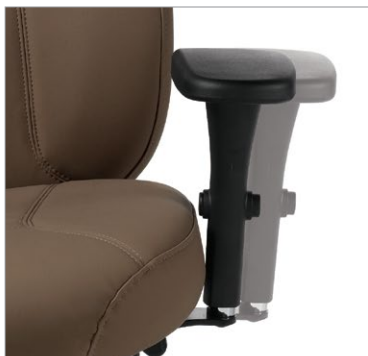
Width adjustable arms can accommodate a wide range of users and working styles