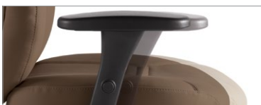
A sliding seat depth adjustment is featured on knee-tilters, multi-tilters and synchro-tilters