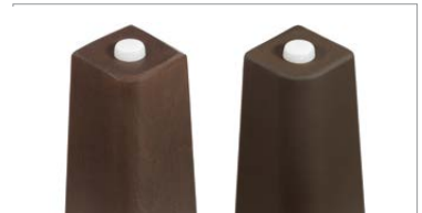
Glide options for wood and urethane legs include non-marking, rubber, steel cushion and felt (non-marking glide shown)

Please visit globalfurnituregroup.com for additional product information including industry and environmental certifications.