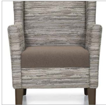
Two tone upholstery options available