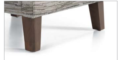
Square, tapered wood legs available in a range of finishes