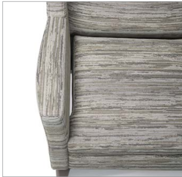
Clean out around seat