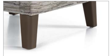
Durable urethane legs available in a variety of colors