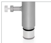
3" height adjustable legs with preset locking pin