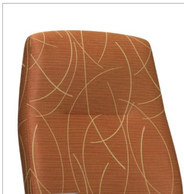
Concealed Schukra adjustable headrest support for easy adjustment and individual comfort (on select models)