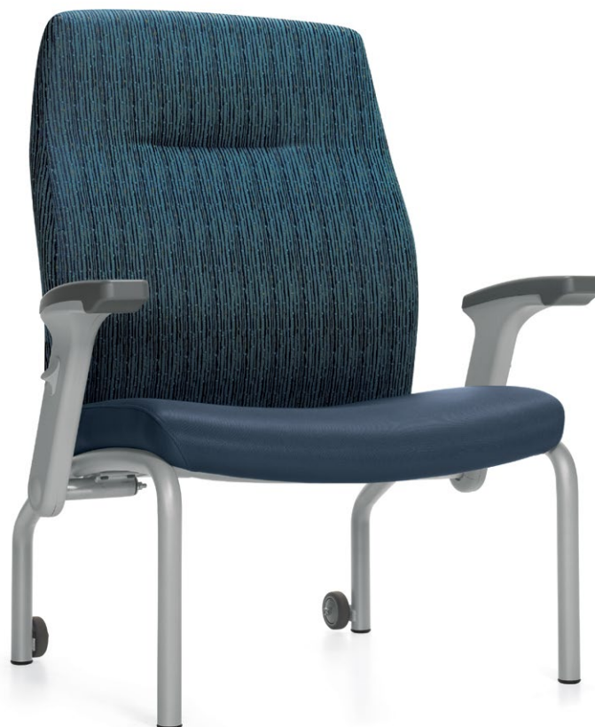
Bariatric high back patient chair

Nourish™ was developed in consultation with leading healthcare professionals. It is an innovative, state-of-the-art patient chair that offers unique features to accommodate a variety of body types, sizes and mobility issues. To facilitate safe patient transfer, each arm can easily be raised allowing horizontal movement in and out of the chair.