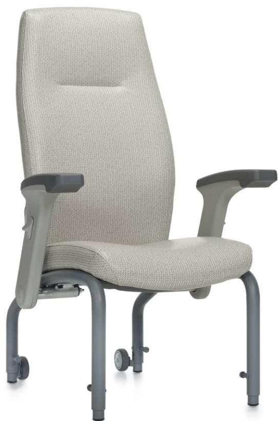
High back patient chair with Schukra lumbar and headrest