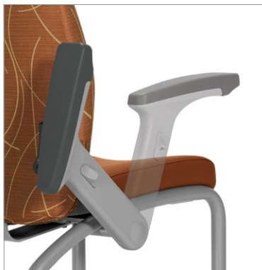
Patient transfer arms fold out of the way when the trigger is released and allow horizontal movement in and out of the chair