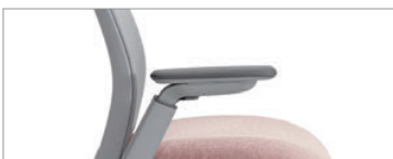
Two height adjustable arm options (2D and 4D)