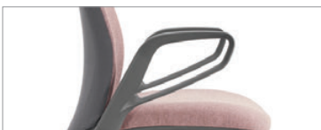
Fixed P-style arm