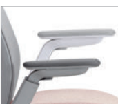
2D arms are height adjustable with front/back sliding armcaps