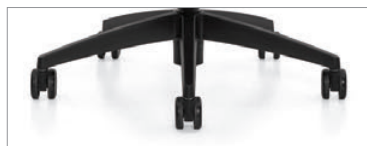
Black base with Black casters