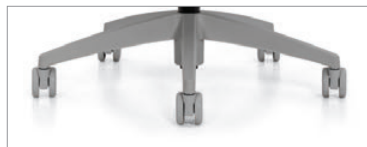
Fog base with Fog casters