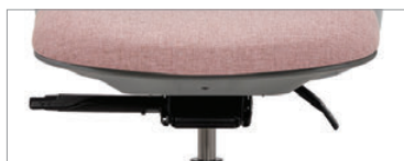
Weight sensing synchro-tilter