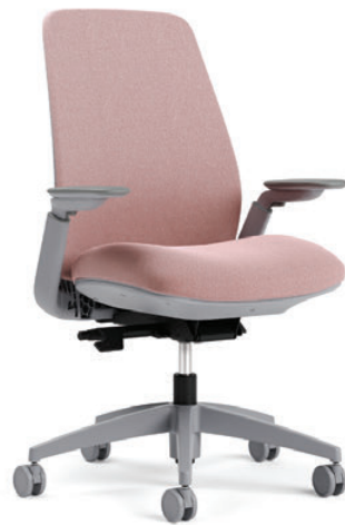
Upholstered back chair, weight sensing synchro-tilter