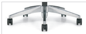
Polished aluminum base with Black casters

Please visit globalfurnituregroup.com for additional product information including industry and environmental certifications.