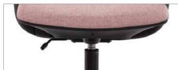
Task basic swivel