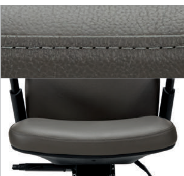
Coated textiles and leather seats include perimeter stitch detail