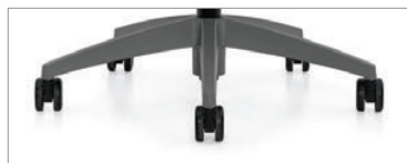
Shadow base with Black casters