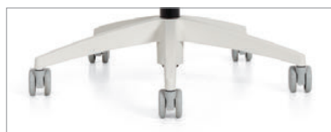
Cloud base with Fog casters