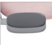
4D arms are height adjustable with front/back/side sliding and rotating armcaps