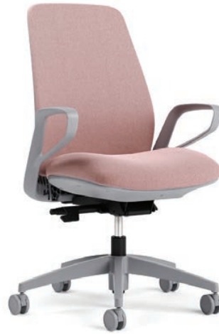
Upholstered back chair, weight sensing synchro-tilter