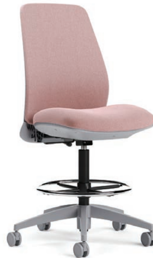
Armless upholstered back height adjustable stool, task basic swivel