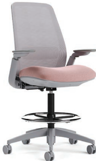
Mesh back height adjustable stool, task basic swivel