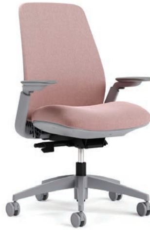
Upholstered back chair, weight sensing synchro-tilter