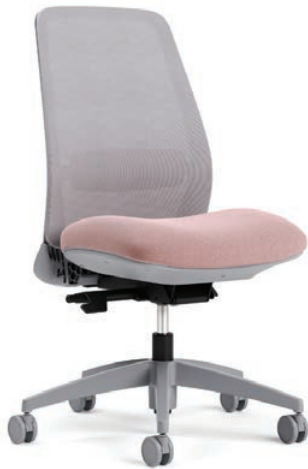
Armless mesh back chair, weight sensing synchro-tilter