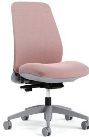
Armless upholstered back chair, weight sensing synchro-tilter