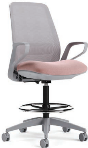
Mesh back height adjustable stool, task basic swivel