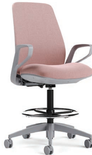
Upholstered back height adjustable stool, task basic swivel

Height adjustable stools support counter and bar height seating in education and workplace applications. Noetic is GREENGUARD Gold and BIFMA LEVEL 3 certified and is backed by Global's Limited Lifetime Warranty.