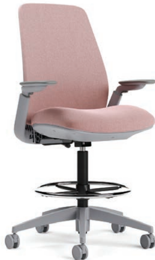
Upholstered back height adjustable stool, task basic swivel

Noetic offers a range of task chairs with three mechanisms, mesh or upholstered backs, and models with or without arms. Back height, seat depth and arm adjustment options support a range of body types and seating preferences.