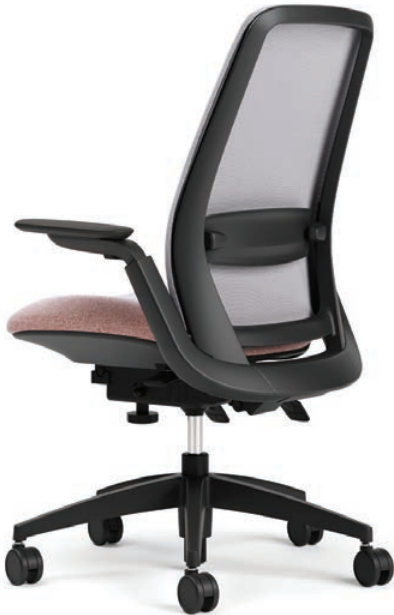
Black frame and base