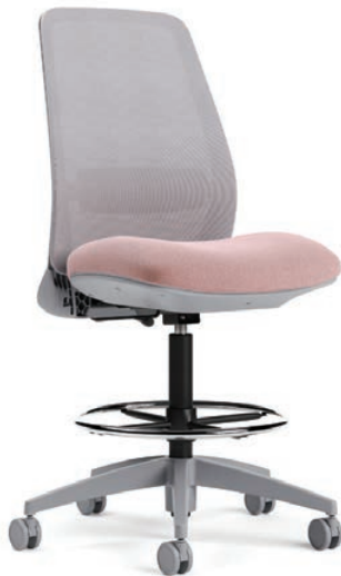
Armless mesh back height adjustable stool, task basic swivel