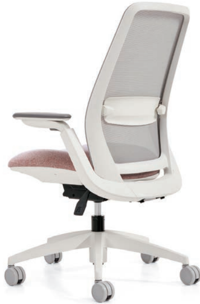
Cloud frame and base

Personalize your Noetic chair with a choice of seven Dimension Mesh and six Digital Mesh colors. Bring it all together with four frame finishes, matching arms and bases, and a comprehensive selection of Global Carded or Alliance Partner textiles.