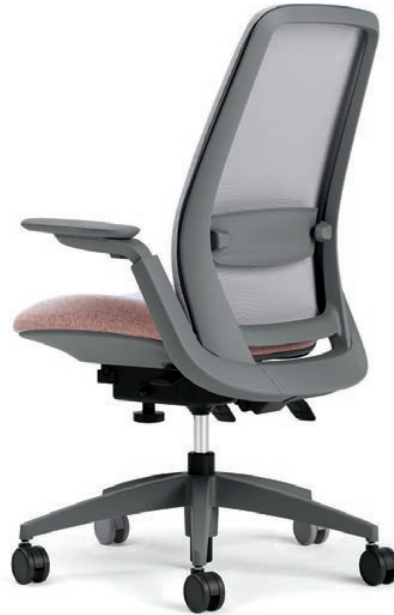
Shadow frame and base