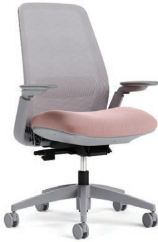
Mesh back chair, weight sensing synchro-tilter