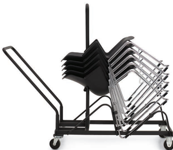
Plastic sled base chairs stack 5 high on the floor and 14 on the dolly Upholstered sled base chairs stack 4 high on the floor and 8 on the dolly