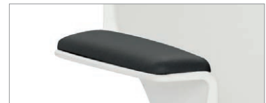
Self-skinned urethane (SSU)