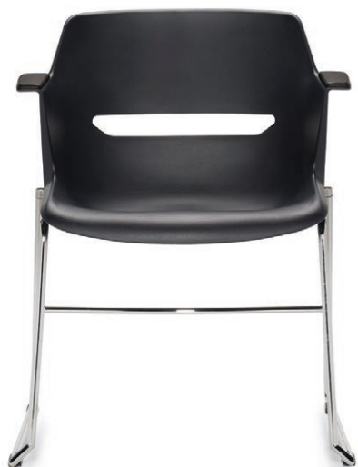
Seating shown in Night shell with Black SSU armcaps and Chrome frame