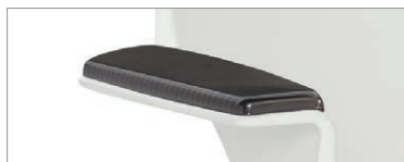
Clear Grey plastic