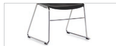
All glides match selected shell color