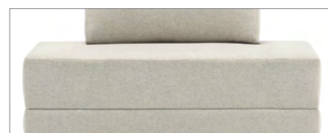
Optional seamless cushion (lounge model only)