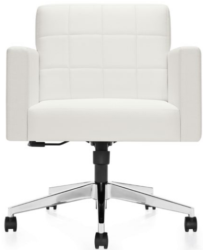
Swivel tilter on five prong base