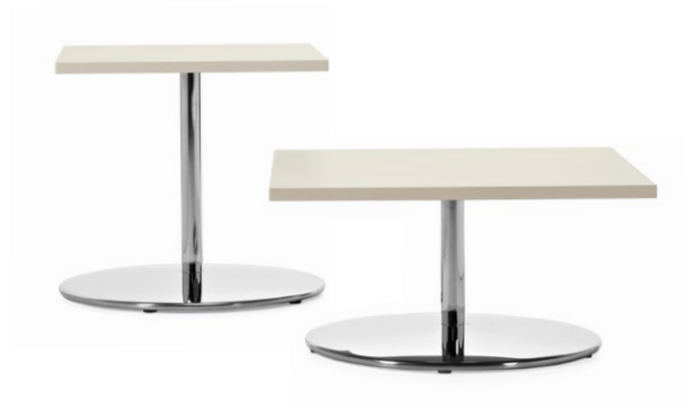
Square end table and square coffee table

Additional information can be found on the Global website .