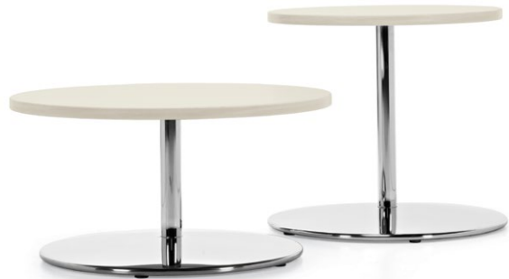
Round coffee table and round end table