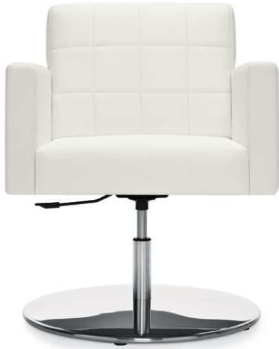
Self-centering lounge chair on pneumatic height adjustable pedestal base