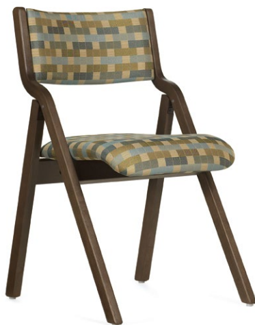
Folding chair upholstered seat and back