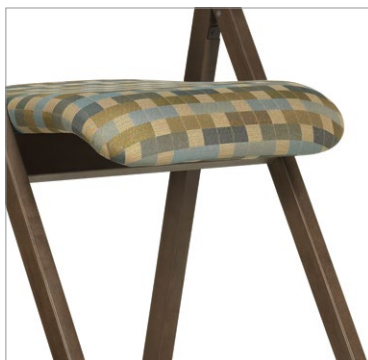
Seats are standard with high density Ultracell foam