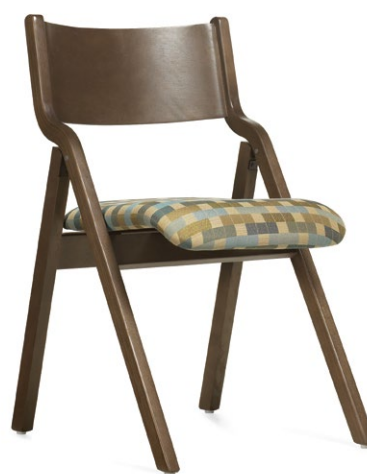
Folding chair upholstered seat and wood back

Janna® features a unique folding frame, making it an excellent solution for temporary guest seating where space is limited. Available with an upholstered or wood back, Janna is ideal for resident/patient rooms, dining rooms, waiting rooms, lobbies, exam rooms, assembly halls and more. Concealed folding mechanism uses metal-to-metal construction details with lock tight fasteners. An optional wall bracket allows the chairs to be conveniently stored while not in use.