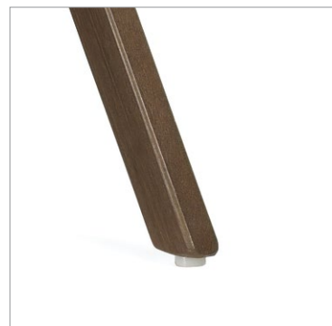
Non-marking glides are standard

Please visit globalfurnituregroup.com for additional product information including industry and environmental certifications.