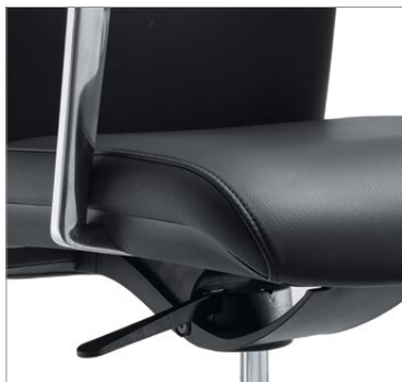
Height adjusting lever