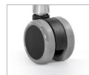
Hard floor casters

Please visit globalfurnituregroup.com for additional product information including industry and environmental certifications. Cover: Seating shown in DesignTex Boucle Houndstooth, Pacific with polished aluminum base.