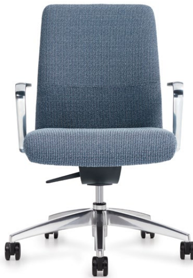
Mid back with fixed arms