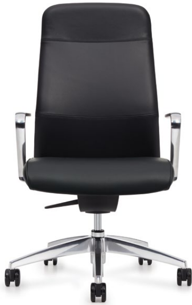
High back with fixed arms