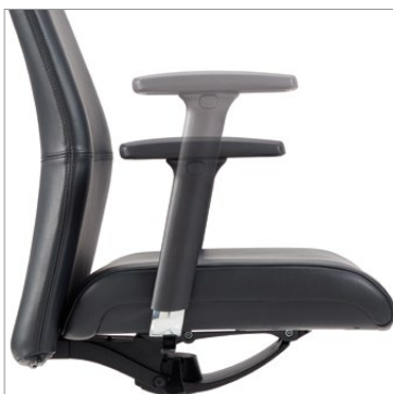
Height adjustable arms