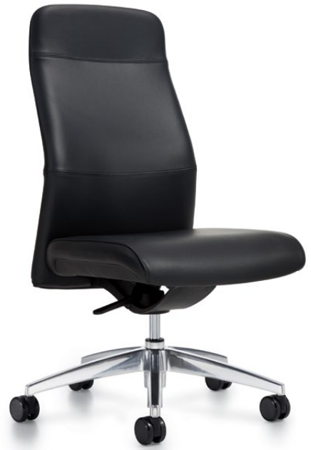
High back, armless