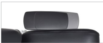
Front / back sliding armcap