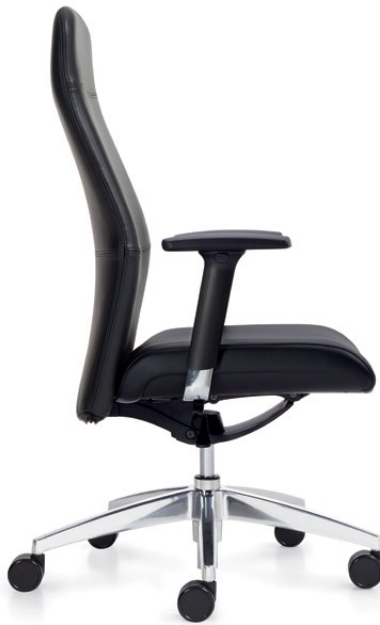
High back with height and width adjustable arms