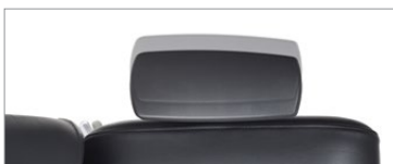
Width adjustable arms