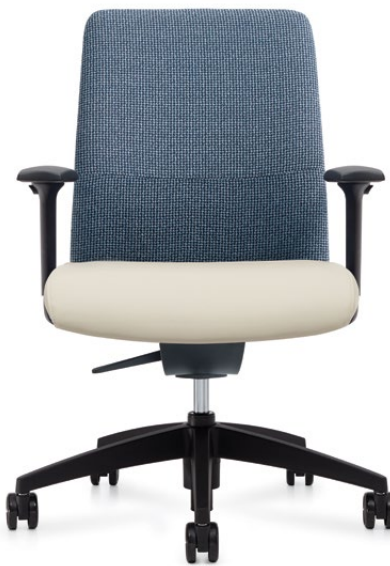
Mid back with height and width adjustable arms