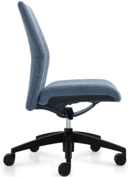
Mid back, armless

The 4" gas cylinder adjusts the seat height between 17" and 21", while maintaining a maximum arm height of 27" (cantilever arms) to clear the underside of table surfaces. The chair base is offered in Black nylon or polished aluminum (optional) to coordinate with the polished aluminum fixed height cantilever arms and the upright details of the adjustable height arms.