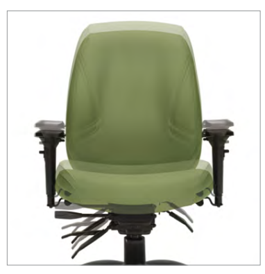
Soft \mathsf{Descent}^{\mathsf{M}} pneumatic cylinder on most models

Please visit globalfurnituregroup.com for additional product information including environmental certifications. Cover: Seating shown in Mayer Durango, Jade.