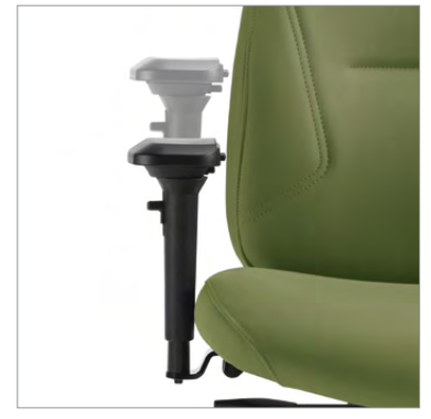
Armrests are standard at a low rise height