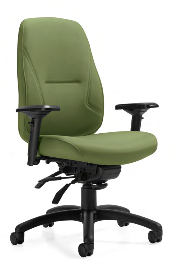
High back knee-tilter with Schukra and generous seat