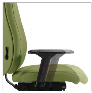
Seat depth adjustment standard on multitilters (except bariatric models) and optional on knee-tilters