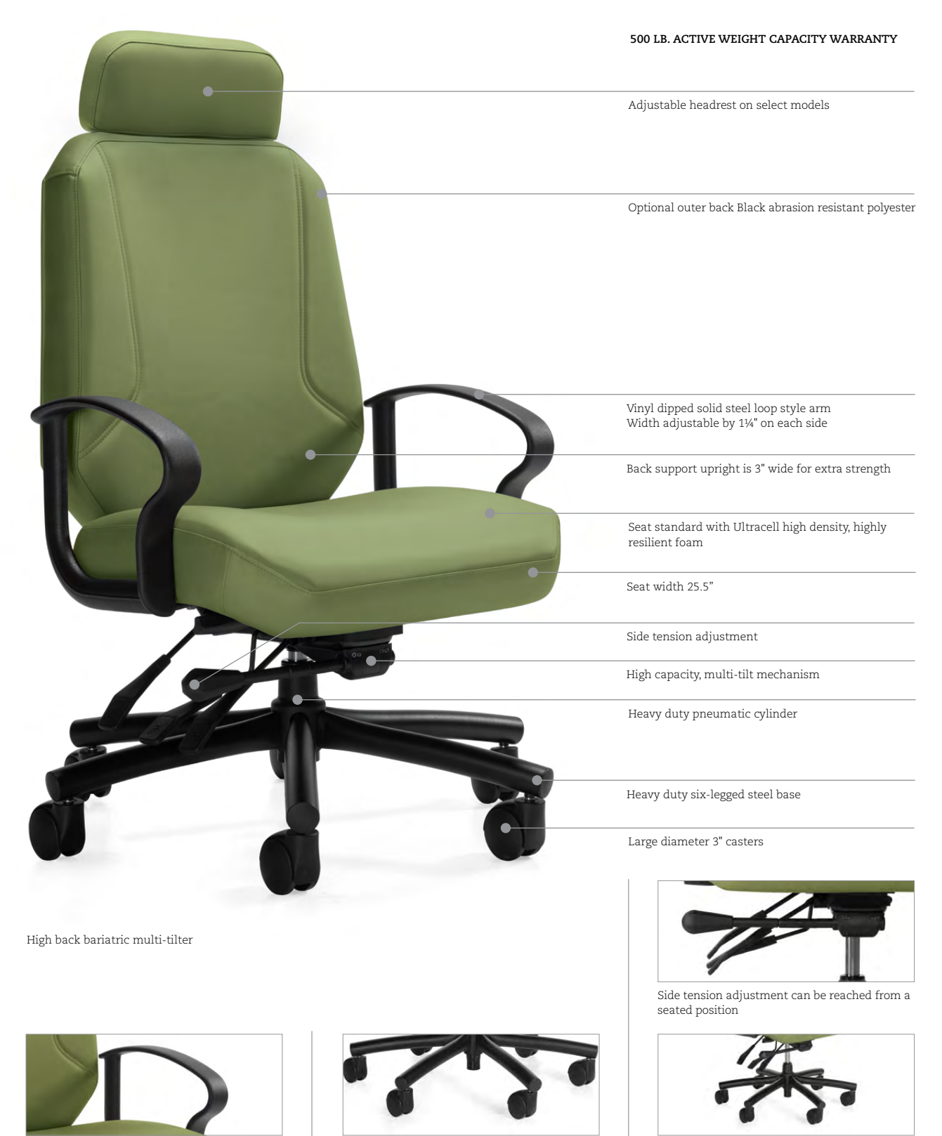
Large diameter 3" Black specially designed casters provide easy mobility for users up to 500 lbs.

32" diameter, heavy duty six-legged oval tubular steel base