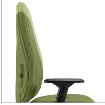
Vertical back height ratchet adjustment of 5¼", standard on most models. Back support upright is 3" wide for extra strength

1350 Flint Rd., Toronto Ontario Canada M3J 2J7 Sales & Marketing: Tel (1-877) 446-2251