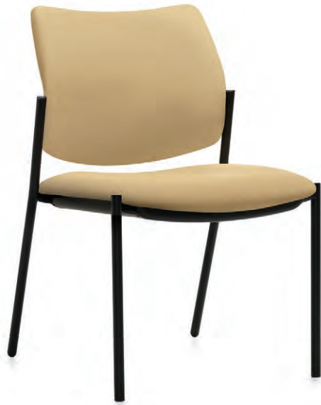
Armless, low back, four-legged