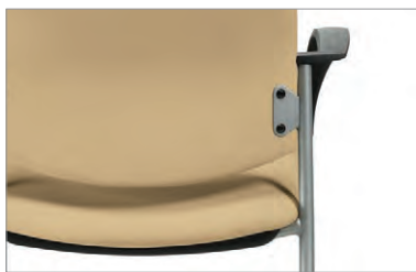
Single piece back with pull-over cover upholstery. Support brackets are fastened on the outer back.