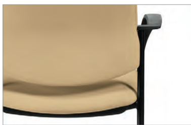
Two piece back allows support brackets to be concealed.