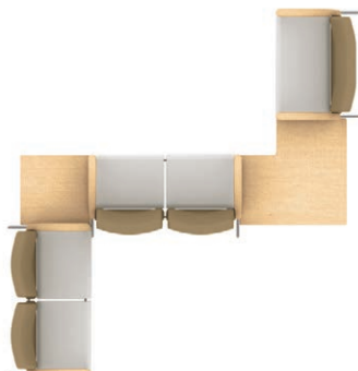
Layout G 1x GC4232, 1x GC4232R, 1x GC4241L, 1x GC4277-HP, 1x GC4282-HP