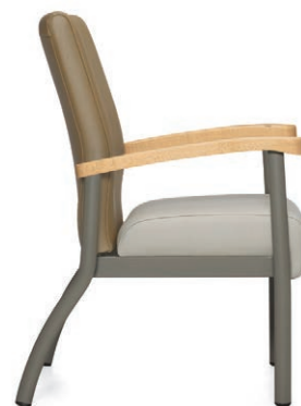
Low Back Armchair, frame shown in Toast (TOA). Hardwood armcaps in Maple (AVM).