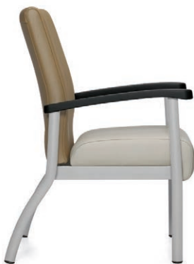
Low Back Armchair, frame shown in Tungsten (TUN). Urethane armcaps shown in Black (BLK).