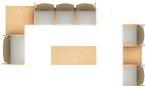
Layout E 1x GC4235R, 1x GC4241L, 1x GC4231L, 1x GC4231R, 1x GC4277-HP, 1x GC4283-HP, 1x GC4275-HP