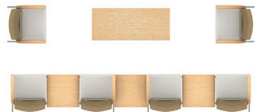
Layout F 2x GC4231, 1x GC4236L, 1x GC4236R, 1x GC4283-HP, 1x GC4275-HP