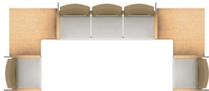
Layout C 1x GC4233B, 1x GC4231L, 1x GC4231R, 2x GC4277-HP