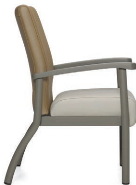
Low Back Armchair, frame and urethane armcaps shown in Toast (TOA).