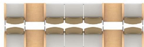
Layout H 2x GC4233B, 2x GC4231L, 2x GC4231R, 4x GC4275-HP