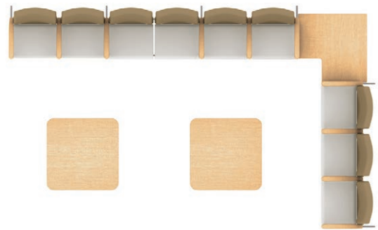
Layout D 1x GC4235R, 1x GC4277, 1x GC4234B, 1x GC4262, 1x GC4234L, 2x GC4284-HP