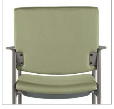
Select Frolick models with sealed seams are designed with a single piece back, with a pull-over style upholstery. Back support brackets fastened on exterior