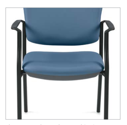
The compound-curved seat cushion is constructed from high density, highly resilient Ultracell foam