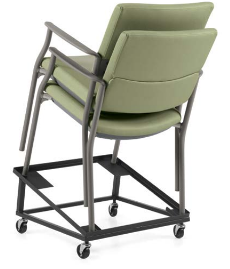
All standard size and four-legged chairs stack eight high on a dolly and five high on the floor. Four-legged bariatric models stack two high on the floor