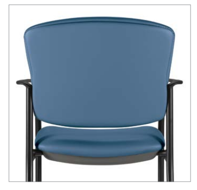
Splash fan shaped back design features a two-piece upholstery solution, concealing back support brackets

Additional information can be found on the Global website.