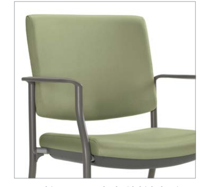
Seat cushions, are standard with high density 1.5" Ultracell foam