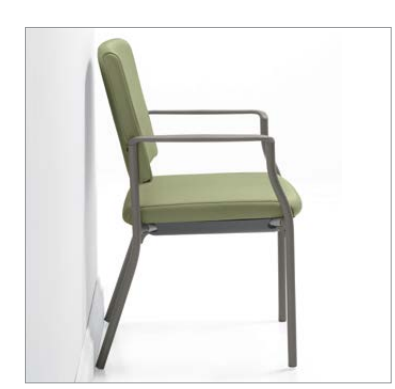
Wall saver rear legs eliminate accidental damage to walls and offer greater stability