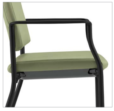
Heavy duty tubular gusseted frames available in Black, Latte, Kalua, Mocha, Shadow, Toast and Tungsten