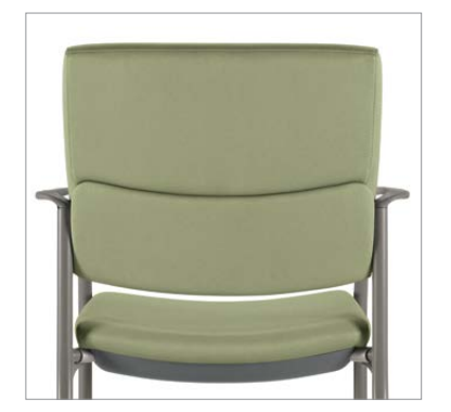
Select Frolick models are designed with a separate lower portion back panel concealing the support brackets (back upholstery features a continuous border on the sides)

Additional information can be found on the Global website.