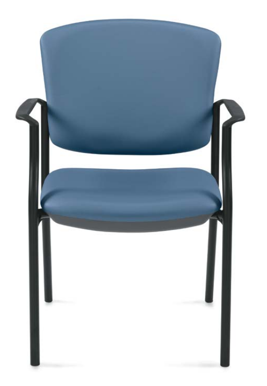
Splash stacking four-legged armchair