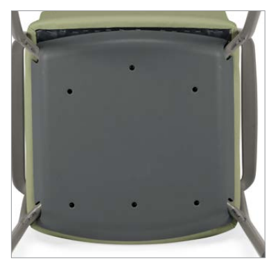
A Shadow finished seat shroud is standard on the underside of regular seat sized models