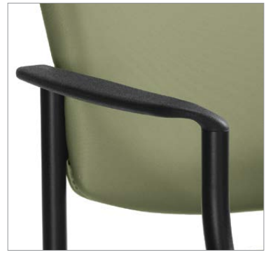
Armrests standard in Black and available in Toast or Shadow