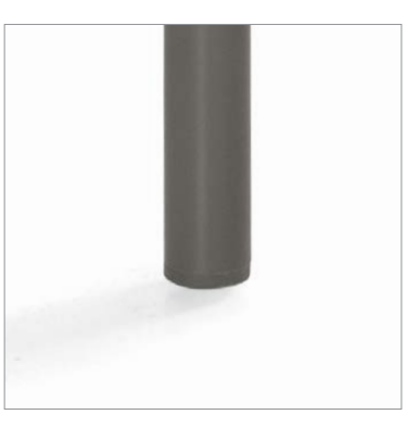
On armless models, Black frames are standard with Black glides and leg caps, all other frame colors are standard with Shadow glides and leg caps. Additional glide options available

Please visit globalfurnituregroup.com for additional product information including industry and environmental certifications.