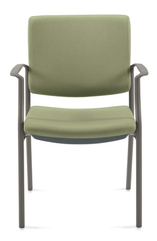
Frolick stacking four-legged armchair

Frolick™ and Splash™ are perfect multi-purpose chairs specifically designed to meet the many challenges within healthcare environments. Two unique backs set the series apart; Splash features a fan shaped back while the Frolick back is rectangular. Both chairs are light in scale, yet heavy duty reinforced gusseted frames create a strong and durable solution.