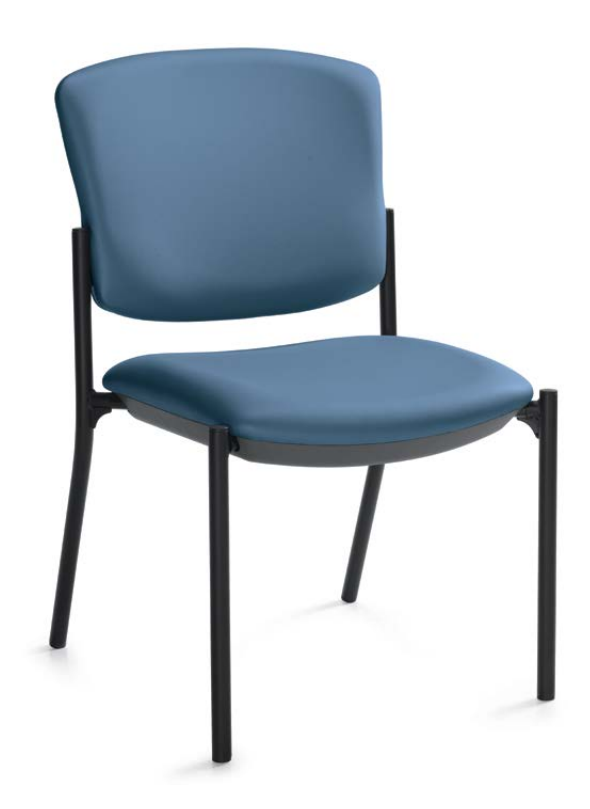
Splash stacking four-legged armless chair

Additional information can be found on the Global website.