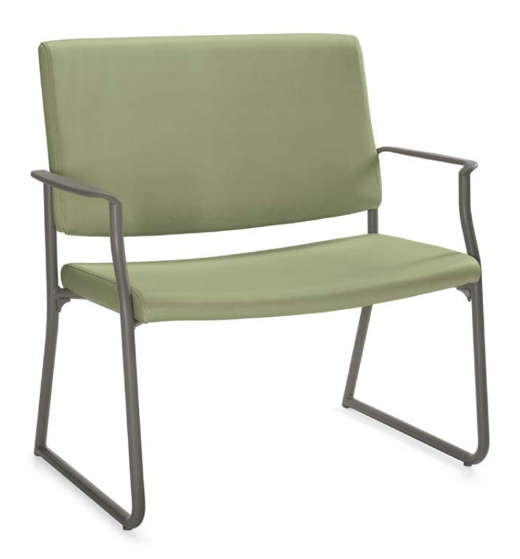
Frolick bariatric sled base armchair