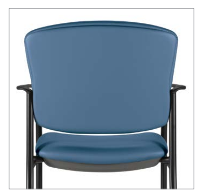
Splash fan shaped back design features a two-piece upholstery solution, concealing back support brackets

Additional information can be found on the Global website.