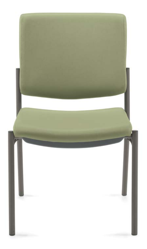
Frolick stacking four-legged armless chair