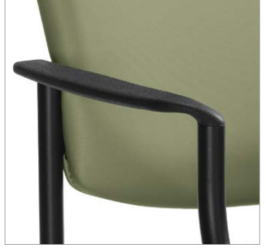
Armrests standard in Black and available in Toast or Shadow