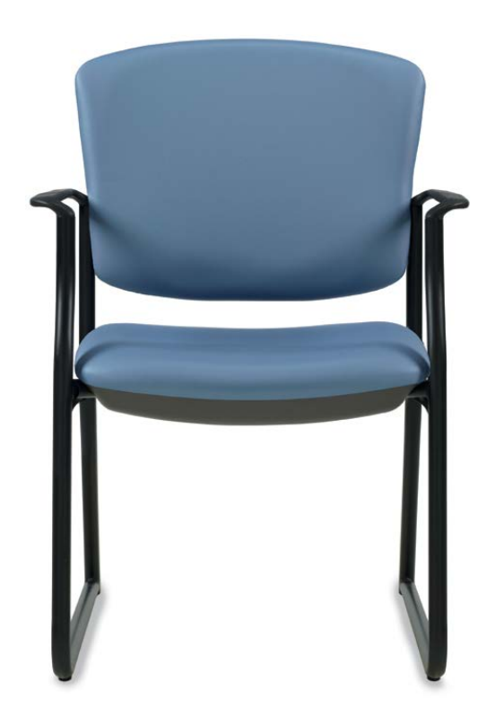
Splash sled base armchair