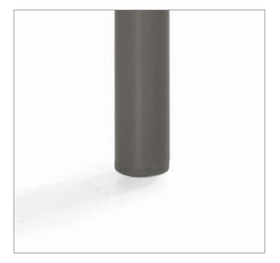
On armless models, Black frames are standard with Black glides and leg caps, all other frame colors are standard with Shadow glides and leg caps. Additional glide options available