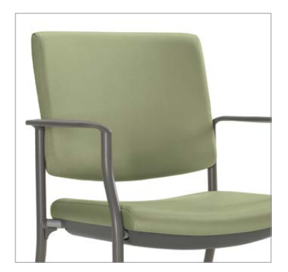
Seat cushions, are standard with high density 1.5" Ultracell foam