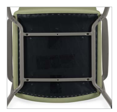
Underside of seat surface can be completely sealed with no seat shroud (select models)