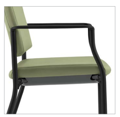
Heavy duty tubular gusseted frames available in Black, Latte, Kalua, Mocha, Shadow, Toast and Tungsten