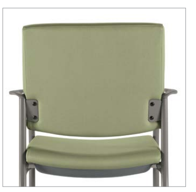
Select Frolick models with sealed seams are designed with a single piece back, with a pull-over style upholstery. Back support brackets fastened on exterior