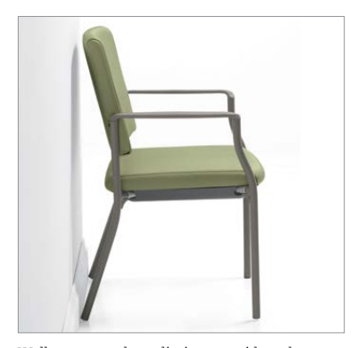
Wall saver rear legs eliminate accidental damage to walls and offer greater stability