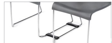
Ganging bracket set for use with all chairs with non-ganging frame

Please visit globalfurnituregroup.com for additional product information including industry and environmental certifications.