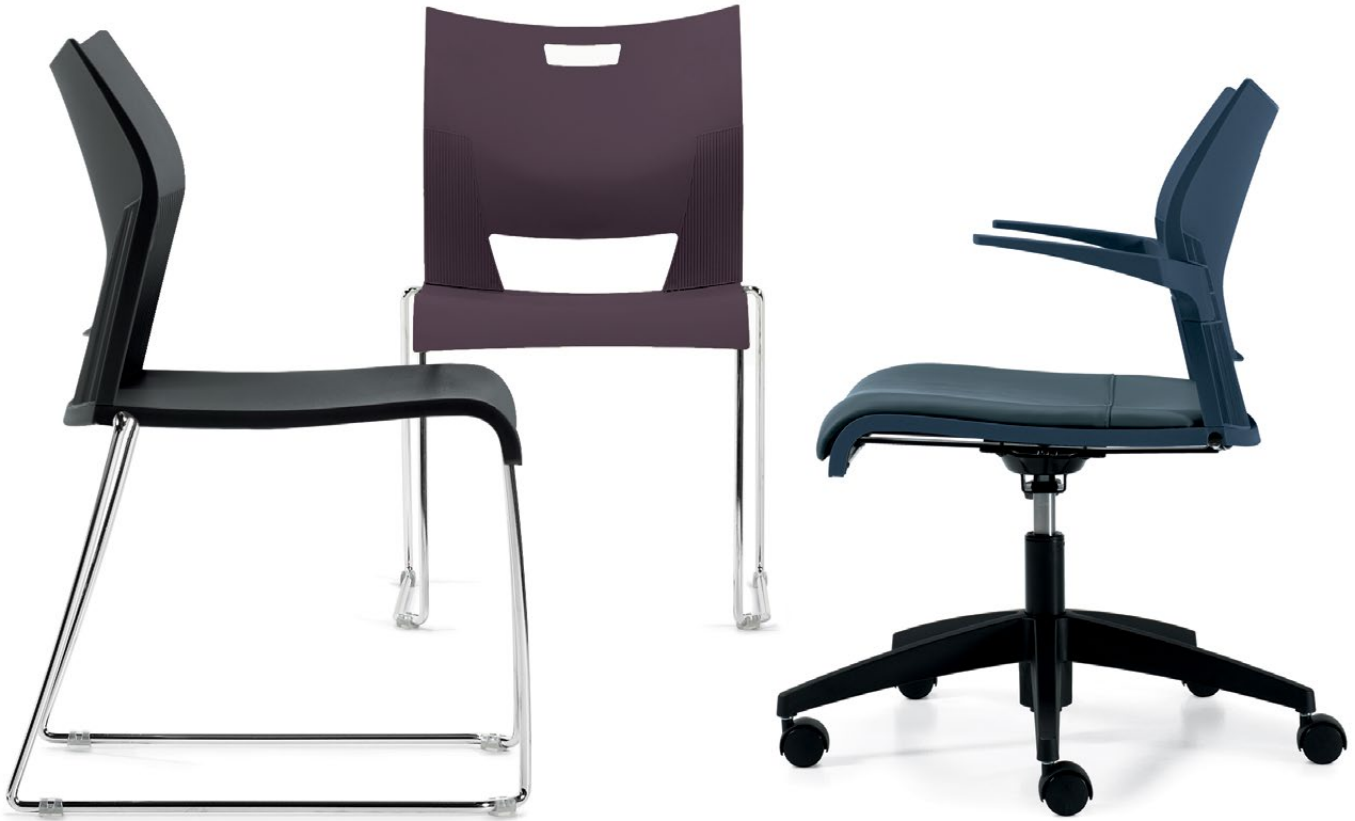
Dark neutrals palette

Backed by Global's Lifetime Warranty, Duet features a lasting solid steel frame and durable polymer seat and back. Duet is manufactured in North America in an ISO 14001 facility.