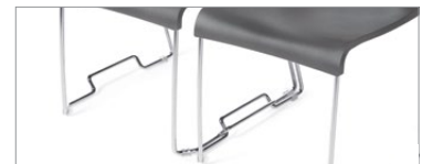
Armless models with ganging frame available