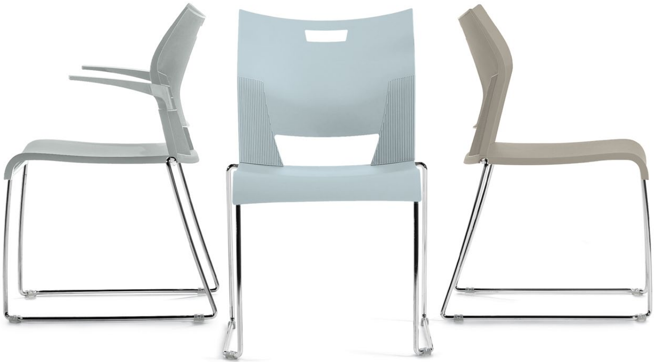
Light neutrals palette

Duet™ is a high density stacking chair with versatility and poise. Use individually around a table or connect in rows in a conference room. Duet stacks up to 40 high on a dolly to store or transport. Choose from our palette of contemporary colors.