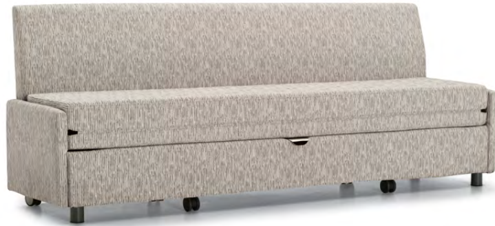
Dreme sleeper armless sofa with upholstered back and pull-out front panel.