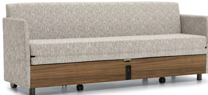
Dreme sleeper sofa with upholstered back and arms. Optional laminate, pull-out front panel shown. Optional power and USB outlet shown.

Seating shown with Walnut Heights panel and Toast legs.