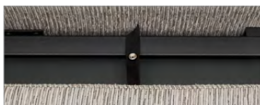
Seat cushion is field replaceable by detaching connection straps