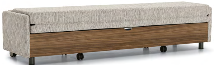
Dreme sleeper bench, low profile design, positions well below room windows to welcome natural light. Optional laminate, pull-out front panel shown.