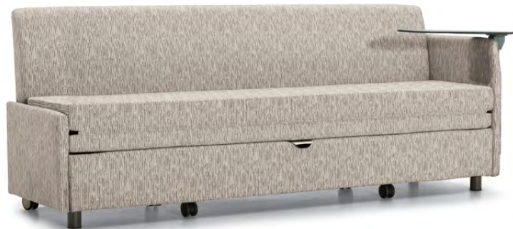
Dreme sleeper sofa with upholstered back, single left arm and tablet (single arm without tablet also available). Flip and rotate tablet is optional on sofas with arms. Upholstered pull-out front panel shown.