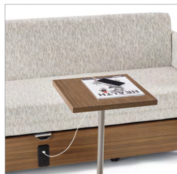
Optional power and USB outlet available on front pull-out panel