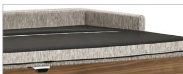
Interior area of the sleep surface cushion is finished in a moisture barrier, coated textile to support infection control practices