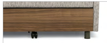
The pull-out front panel is available upholstered or in laminate