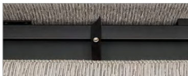
Seat cushion is field replaceable by detaching connection straps