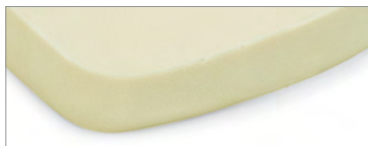
High density Ultracell foam seat for enhanced comfort