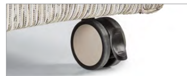
Optional locking front casters provide greater mobility