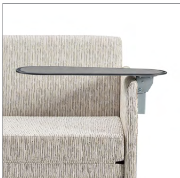
Flip and rotate tablet arm offers convenient surface for users