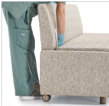
Clean out space supports housekeeping and infection control practices