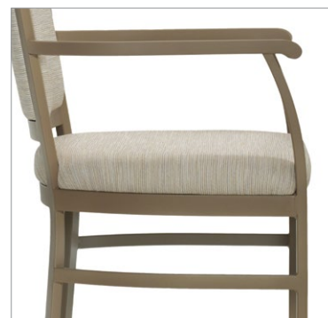
Metal frame available in all Globalcare finishes

Desmond HT is designed with comfort and safety in mind. Urethane armcaps feature forward extended grips that make getting in and out of the chair easy. For lasting performance and infection control, Desmond HT seat cushions are standard with high density Ultracell bio foam and fully encased seams. Additional weight and tamperproof fasteners can also be added to the chair for enhanced safety.