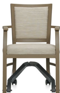
Metal armchair with two rear swivel casters and lift mechanism