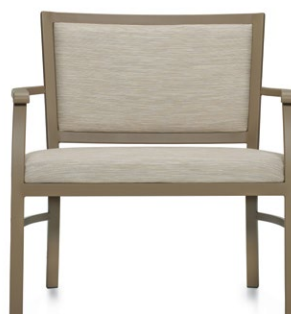
Metal bariatric armchair 750 lbs. active weight capacity