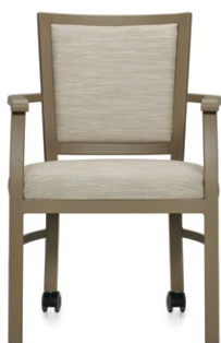
Metal armchair with two rear swivel casters