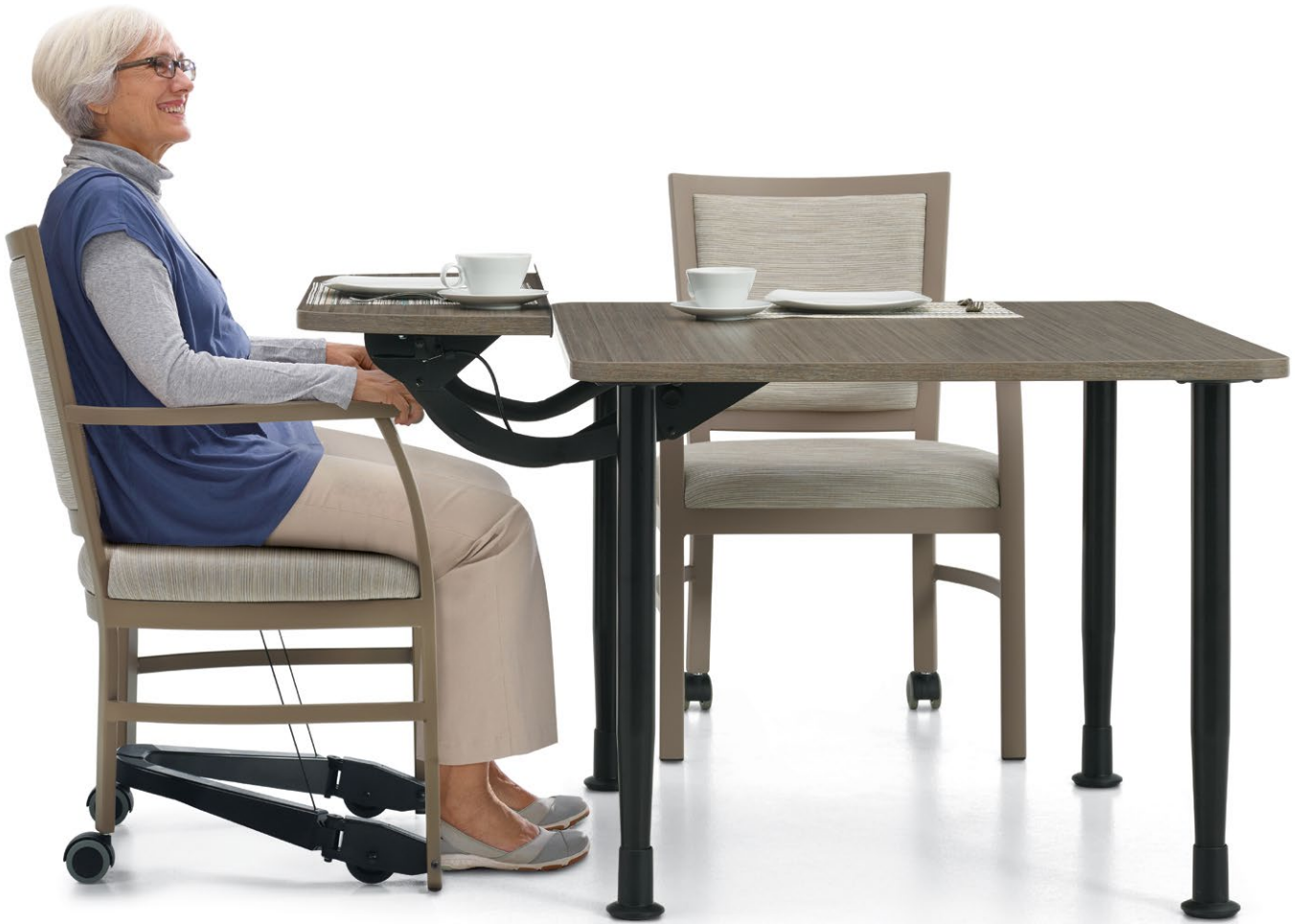
Metal armchair with two rear swivel casters and lift mechanism, metal armchair with two rear swivel casters and Enable table with E-Z lift dual arm tablet.

Desmond™ HT brings warm residential design to today's healthcare environments. Inspired by our best-selling Desmond wood framed chair, the Desmond HT metal frame offers maximum strength in long-term and acute care applications. The seating series features clean lines and a picture frame back that transitions nicely into dining rooms, lobbies, lounges, waiting rooms and patient rooms.