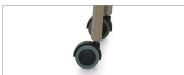
Rear swivel casters allow the chair to be tipped and easily moved