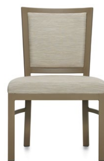
Metal armless side chair